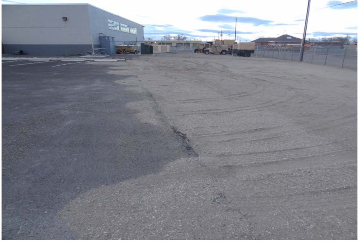
Fallon National Guard Armory Site - Site #9885 Description: Area where paving or soil stabilization is needed.