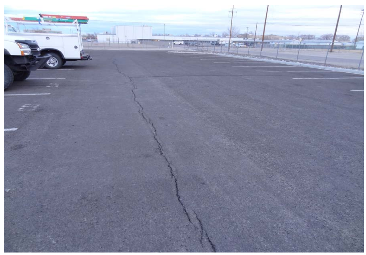
Fallon National Guard Armory Site - Site #9885 Description: Paved parking area in need of crack filling.