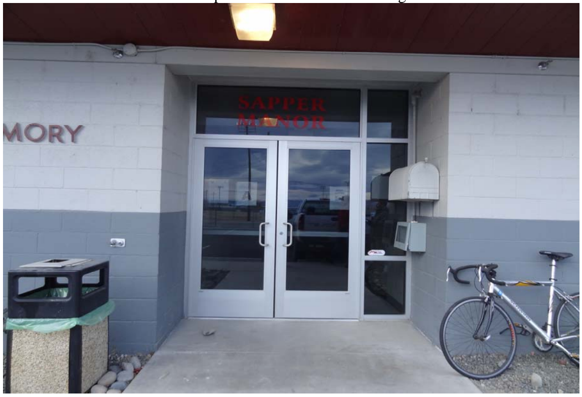
Fallon Armory - Building #0678 Description: Public Entrance.

Storage Building - Building #3087 Description: Exterior of the building.