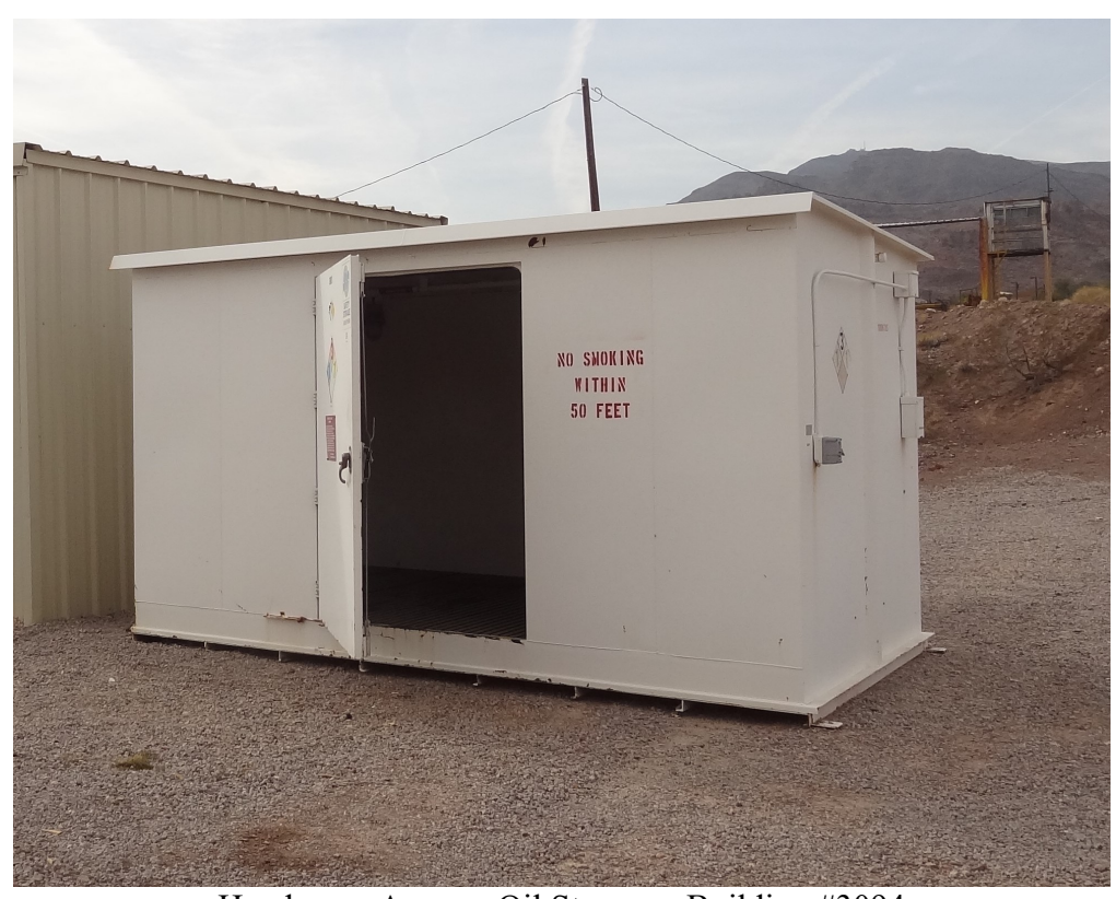
Henderson Armory Oil Storage - Building #3094 Description: View of Oil Storage Building.