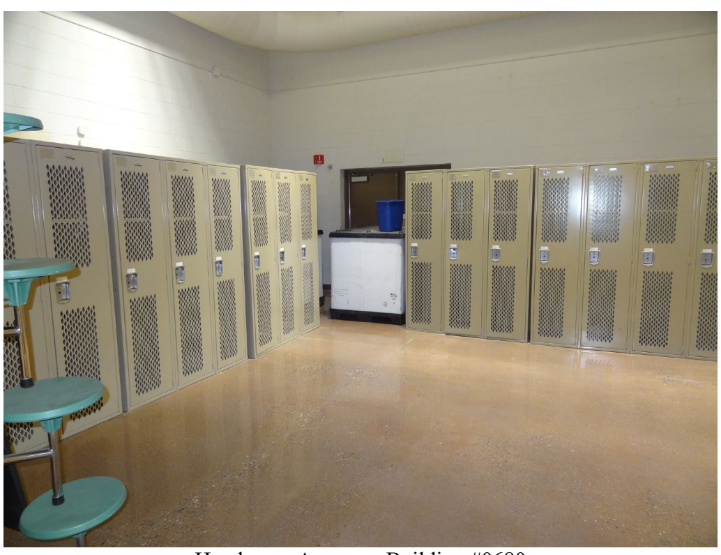
Henderson Armory - Building #0680 Description: Storage Removal Needed.