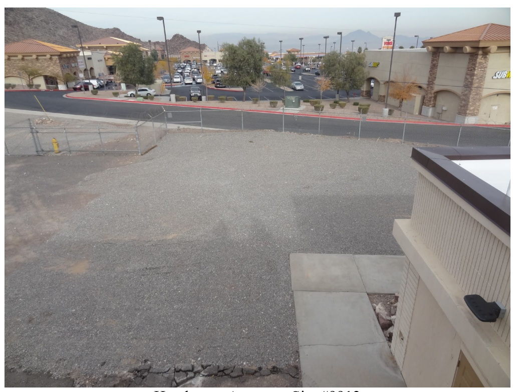
Henderson Armory - Site #9912 Description: Erosion Control Needed on North and South Sides.