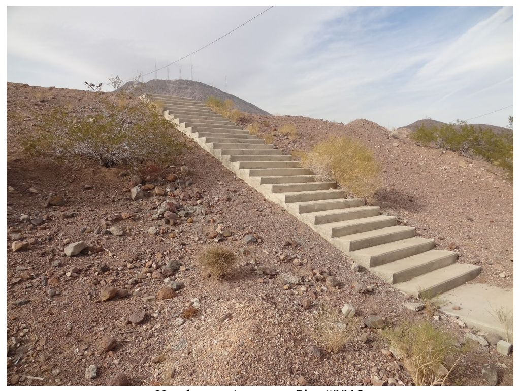
Henderson Armory - Site #9912 Description: Exterior Stair Handrail Installation.