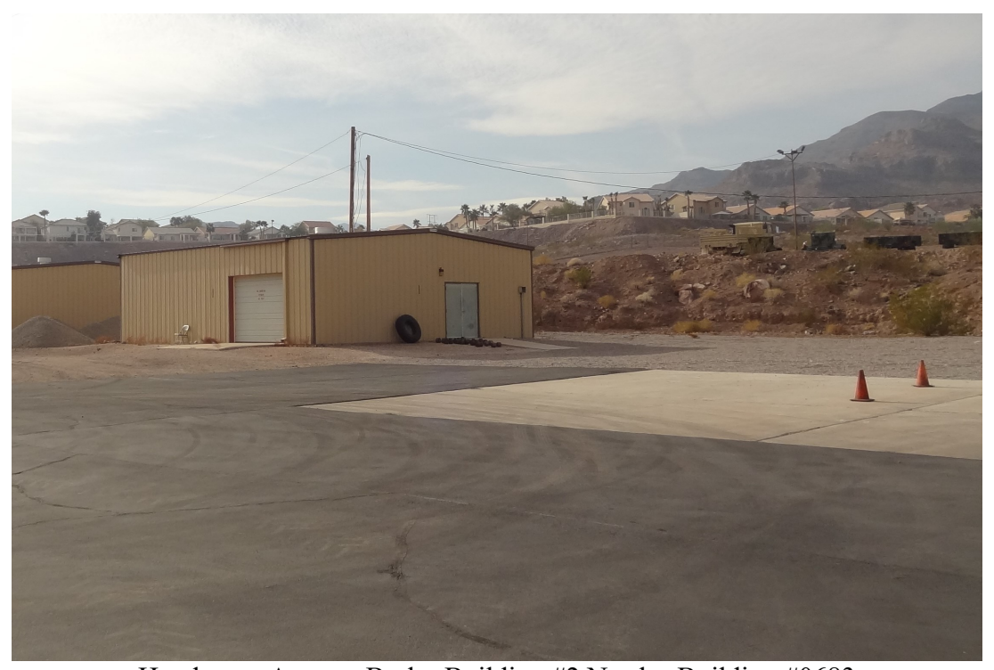
Henderson Armory Butler Building #2 North - Building #0683 Description: View of Butler Building 2 North.