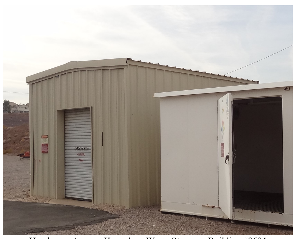
Henderson Armory Hazardous Waste Storage - Building #0684 Description: View of Hazardous Waste Storage Building.