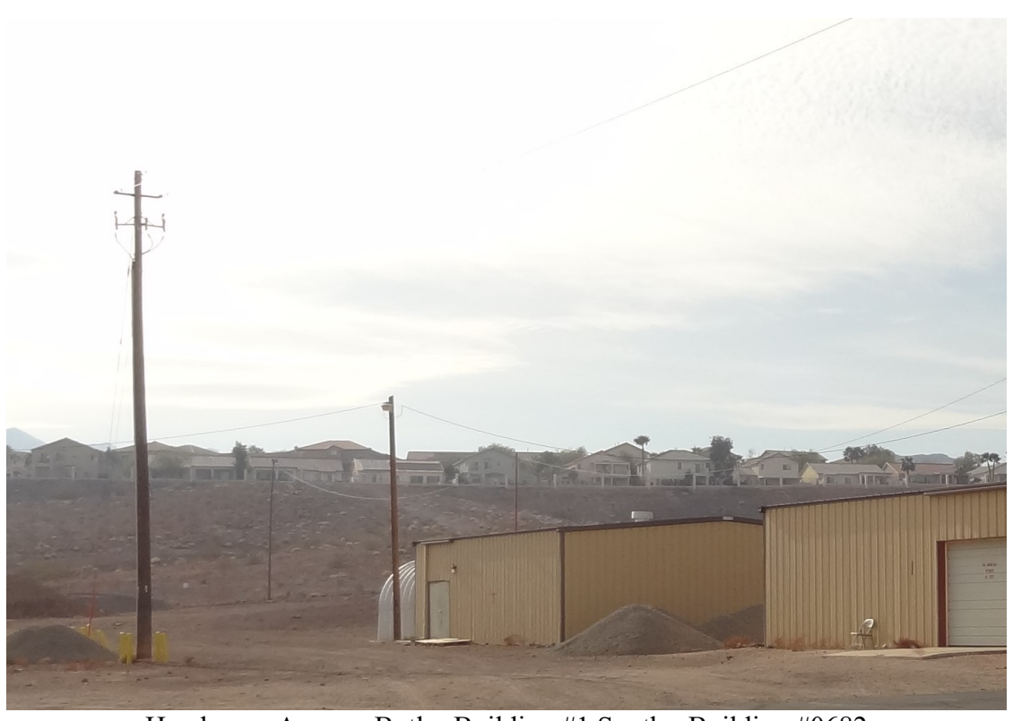
Henderson Armory Butler Building #1 South - Building #0682 Description: View of Butler Building 1 South.