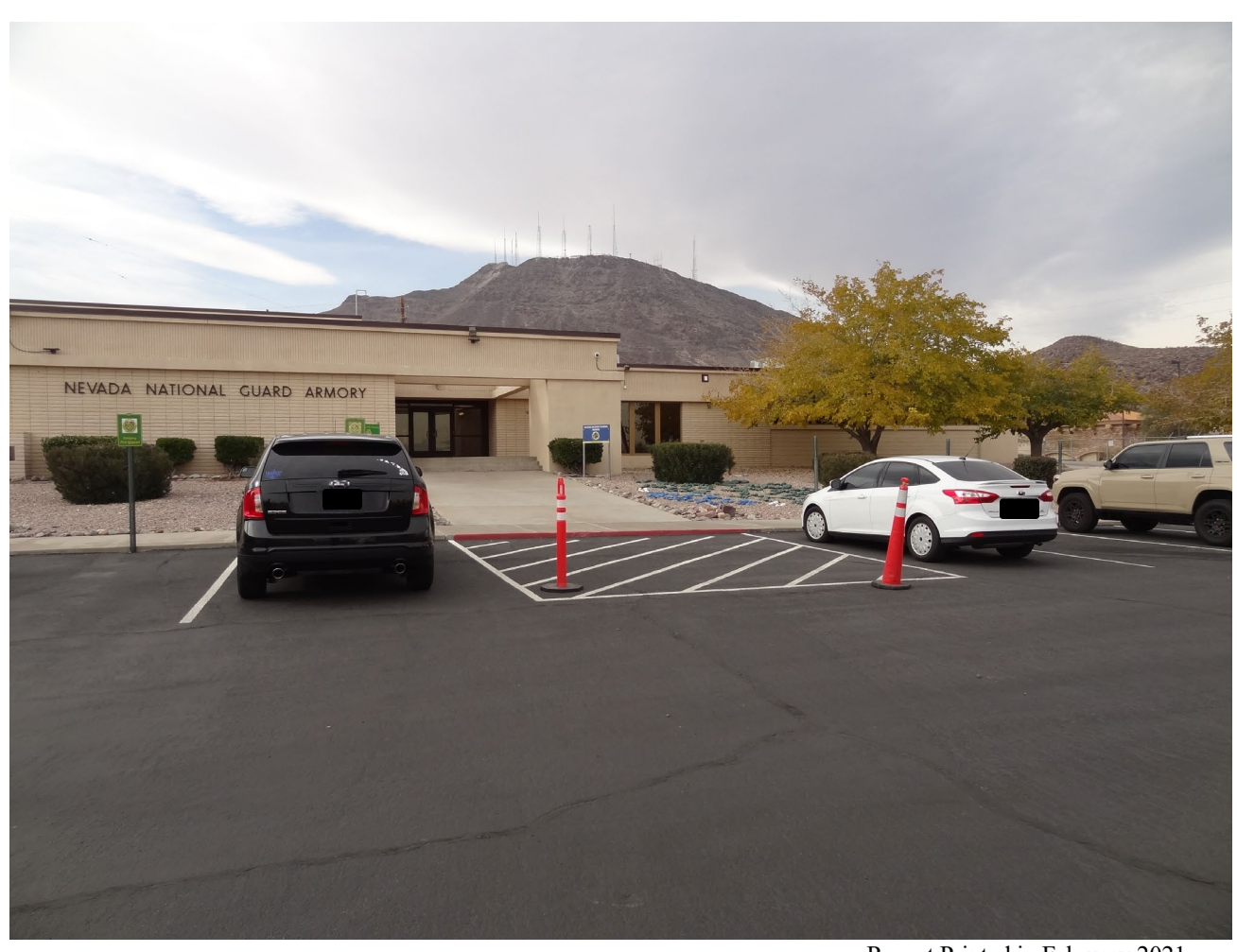
Report Printed in February 2021