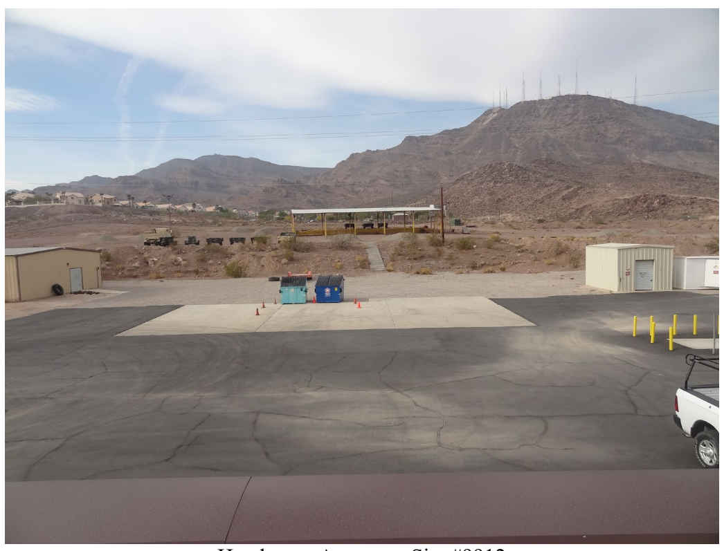
Henderson Armory – Site #9912 Description: Crack Fill & Seal Asphalt Paving.