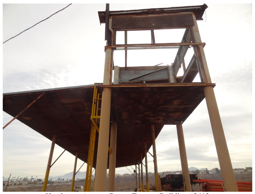
Henderson Armory Range Tower - Building #2412 Description: Guardrail Installation.