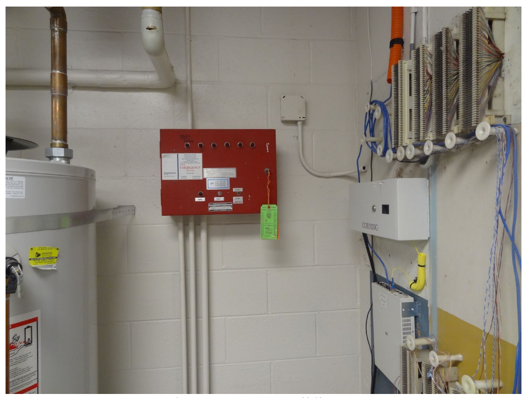
Henderson Armory - Building #0680 Description: Fire Alarm System Upgrades Needed.