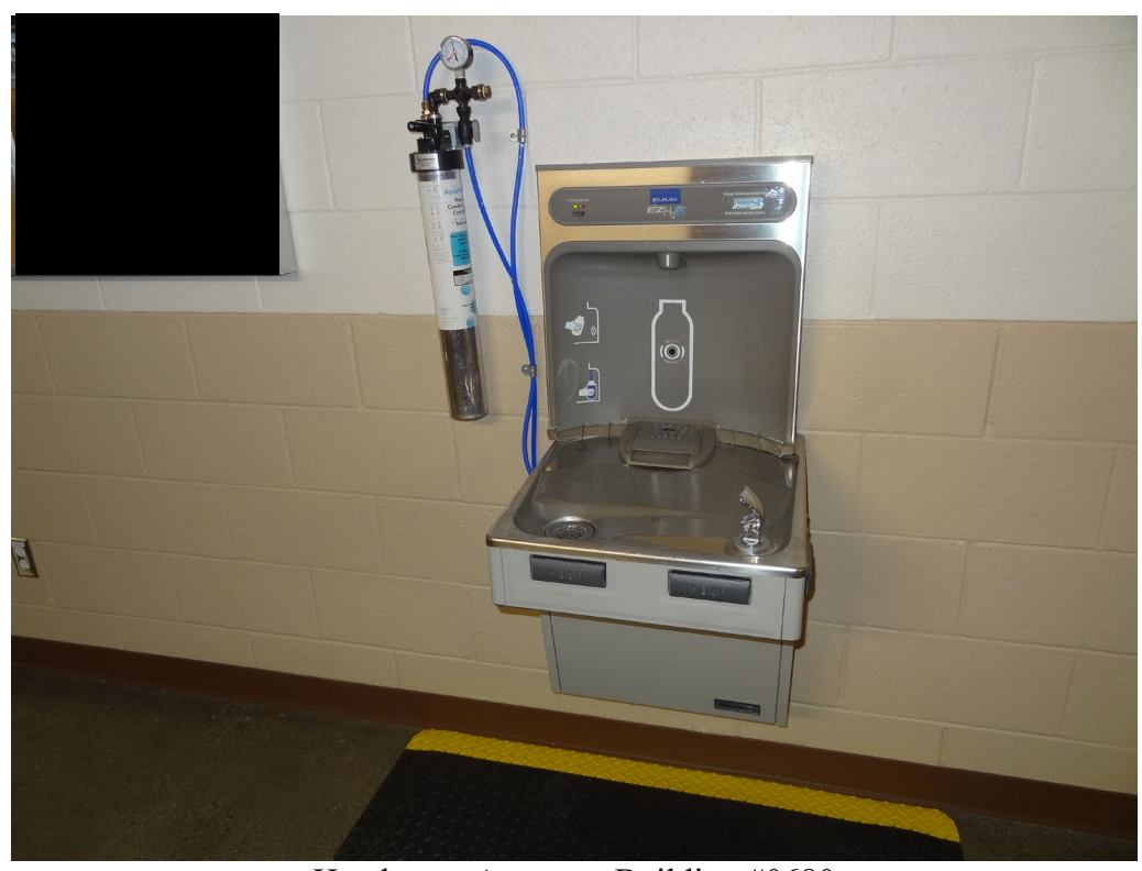
Henderson Armory - Building #0680 Description: Dual Level Drinking Fountain Installation Needed.