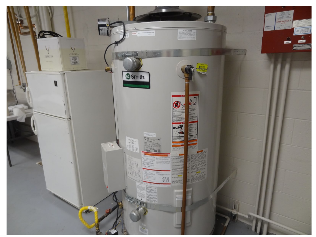
Henderson Armory - Building #0680 Description: Water Heater Replacement Needed.