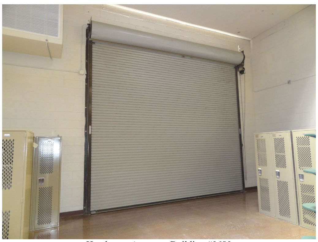
Henderson Armory - Building #0680 Description: Overhead Door Replacement Needed.