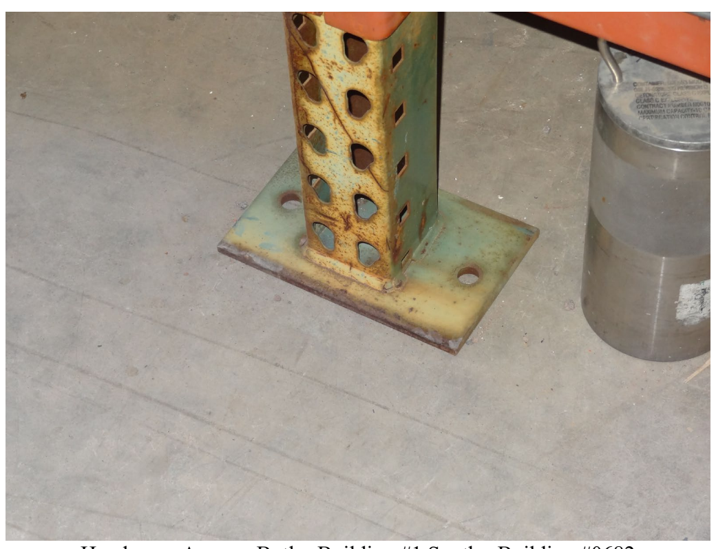
Henderson Armory Butler Building #1 South - Building #0682 Description: Shelves Missing Proper Anchoring.