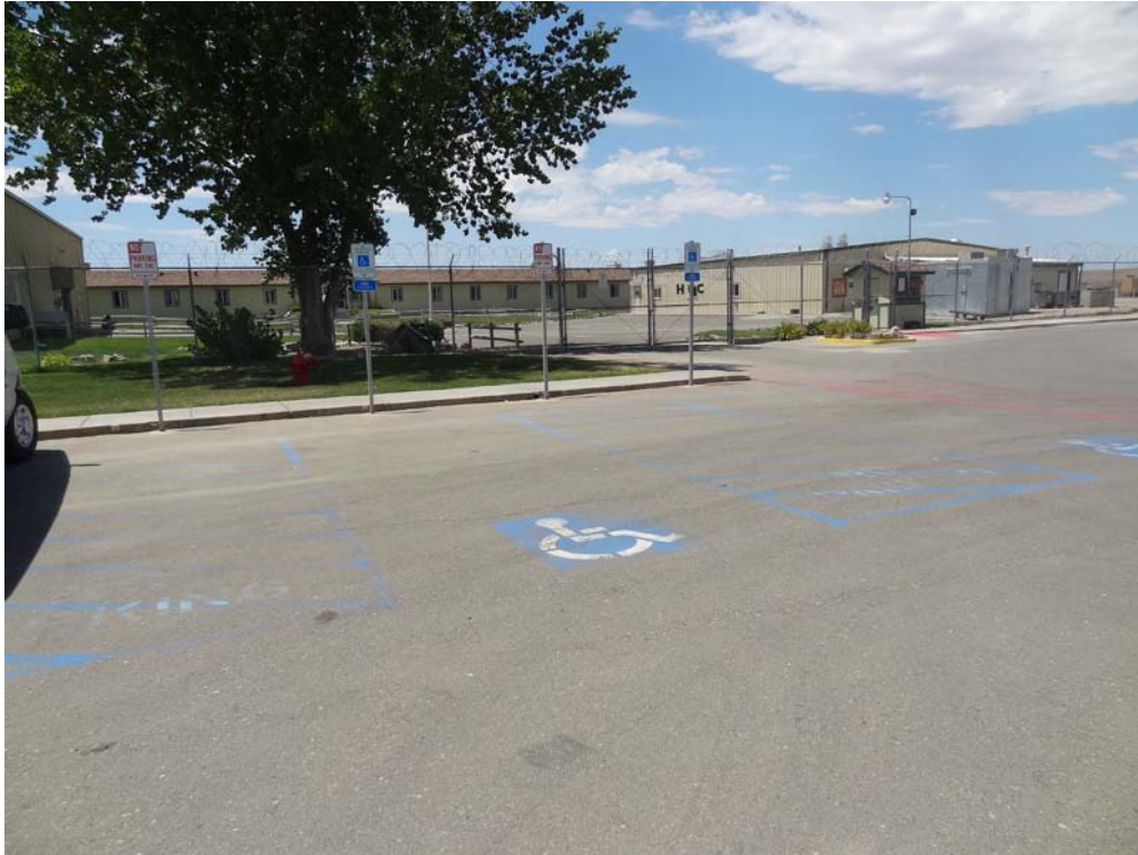
HCC - Site #9972

Description: Existing ADA parking and path of travel.