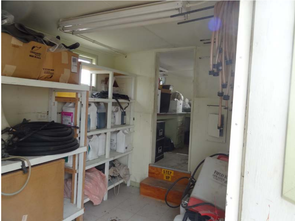
Office Trailer - Building #2140 Description: Hazardous material storage.