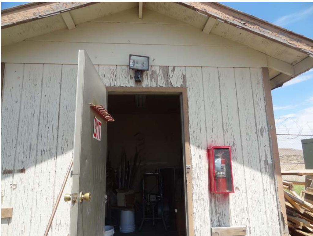
Storage Shed - Building #1398 Description: Exterior finishes.