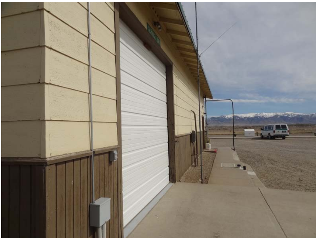
Mechanical Shop - Building #2141 Description: Exterior finishes.