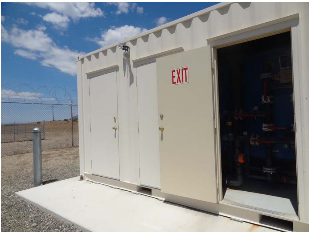
Arsenic Treatment Building - Building #3754 Description: Exterior finishes.