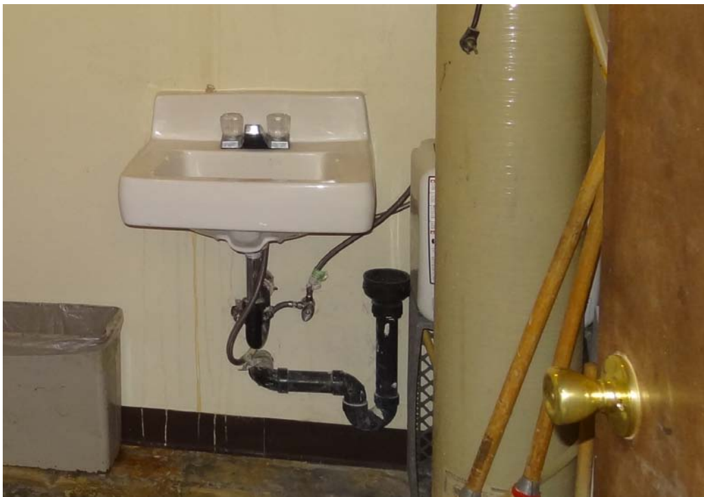
Multi-Purpose Building - Building #1397 Description: Improper plumbing connections.