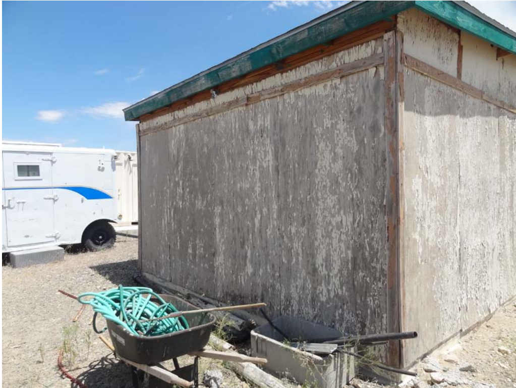
Pump House - Building #1400 Description: Exterior finishes.