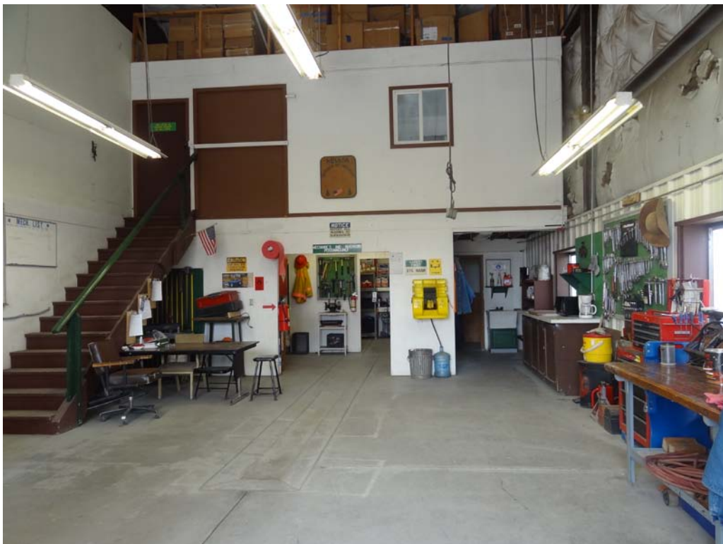
NDF Maintenance Shop - Building #1399 Description: Interior finishes.