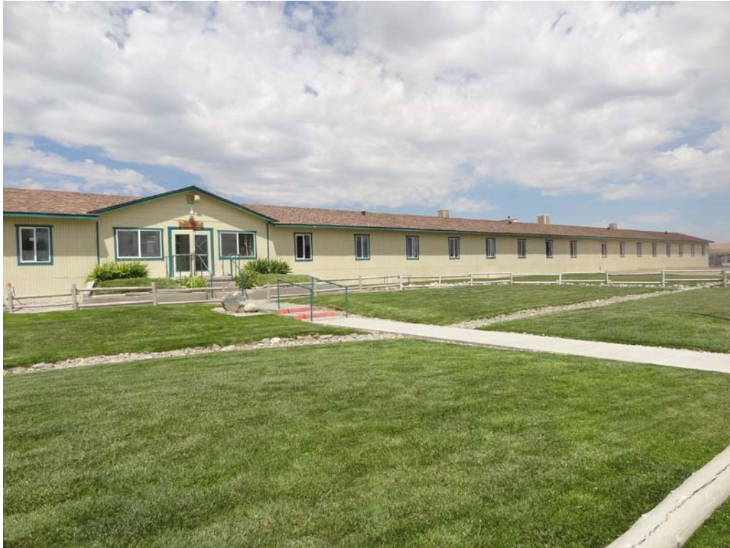
Administration/ Housing Unit - Building #1394 Description: Exterior finishes.