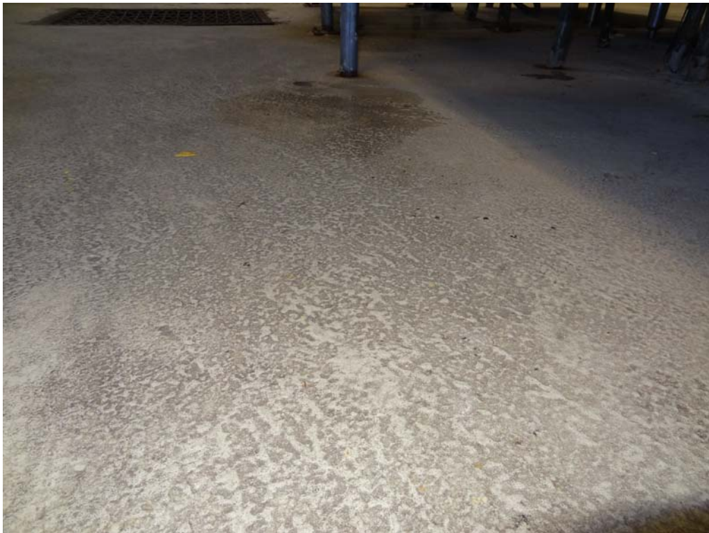
Cafeteria/ Culinary Building - Building #1395 Description: Flooring in poor condition.