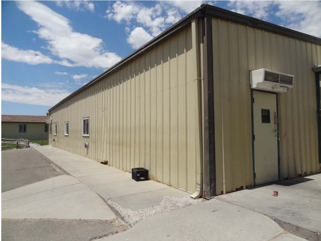
Cafeteria/ Culinary Building - Building #1395 Description: Exterior finishes.