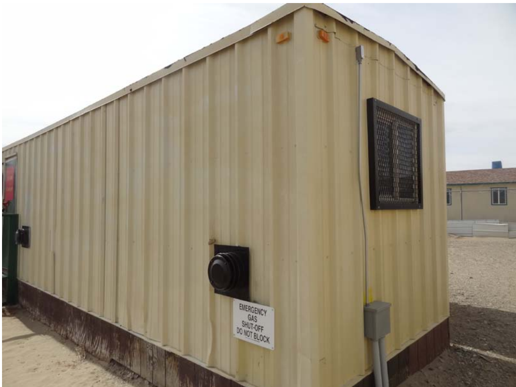
Saw Shop - Building #2138 Description: Exterior finishes including failing wood skirting.