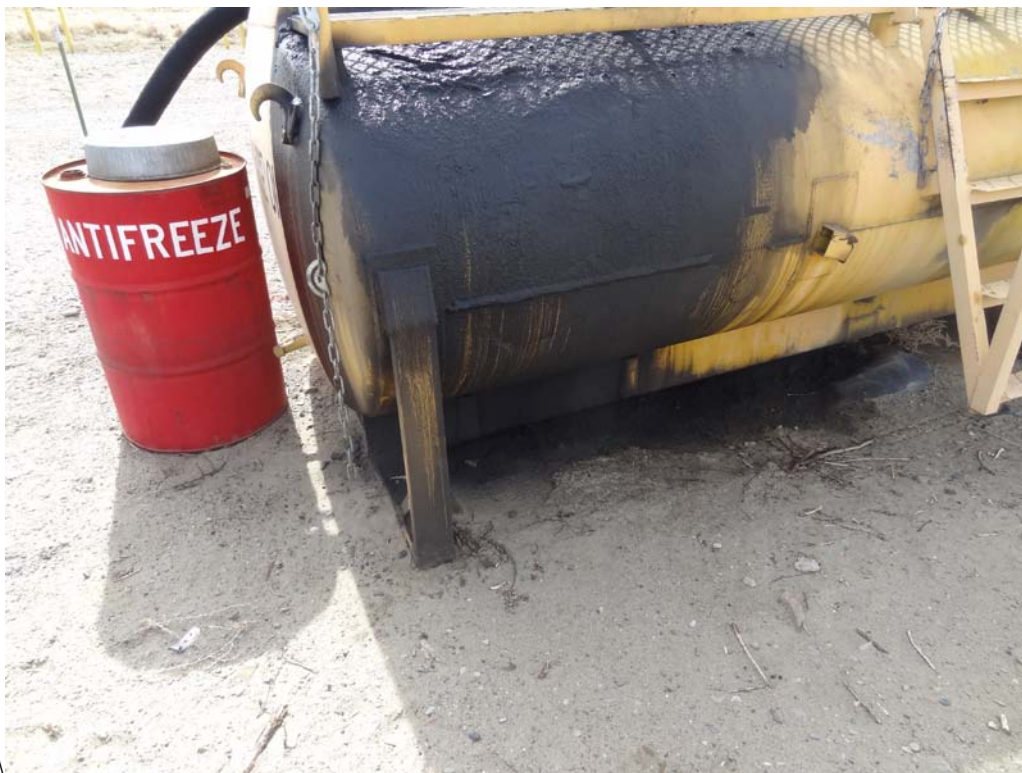
HCC - Site #9972

Description: Existing ADA parking and path of travel.