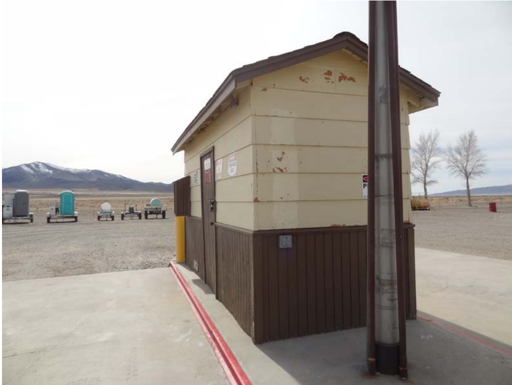
Fuel Island Building - Building #2142 Description: Exterior finishes.