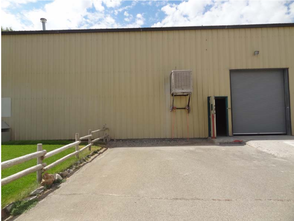
Multi-Purpose Building - Building #1397 Description: Exterior finishes.