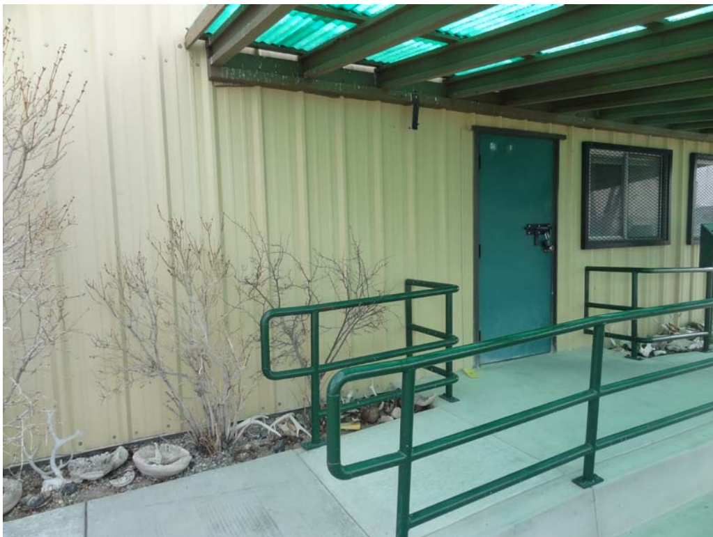
NDF Administration Office - Building #1605 Description: Exterior finishes, flush bolt on exterior of exit door.