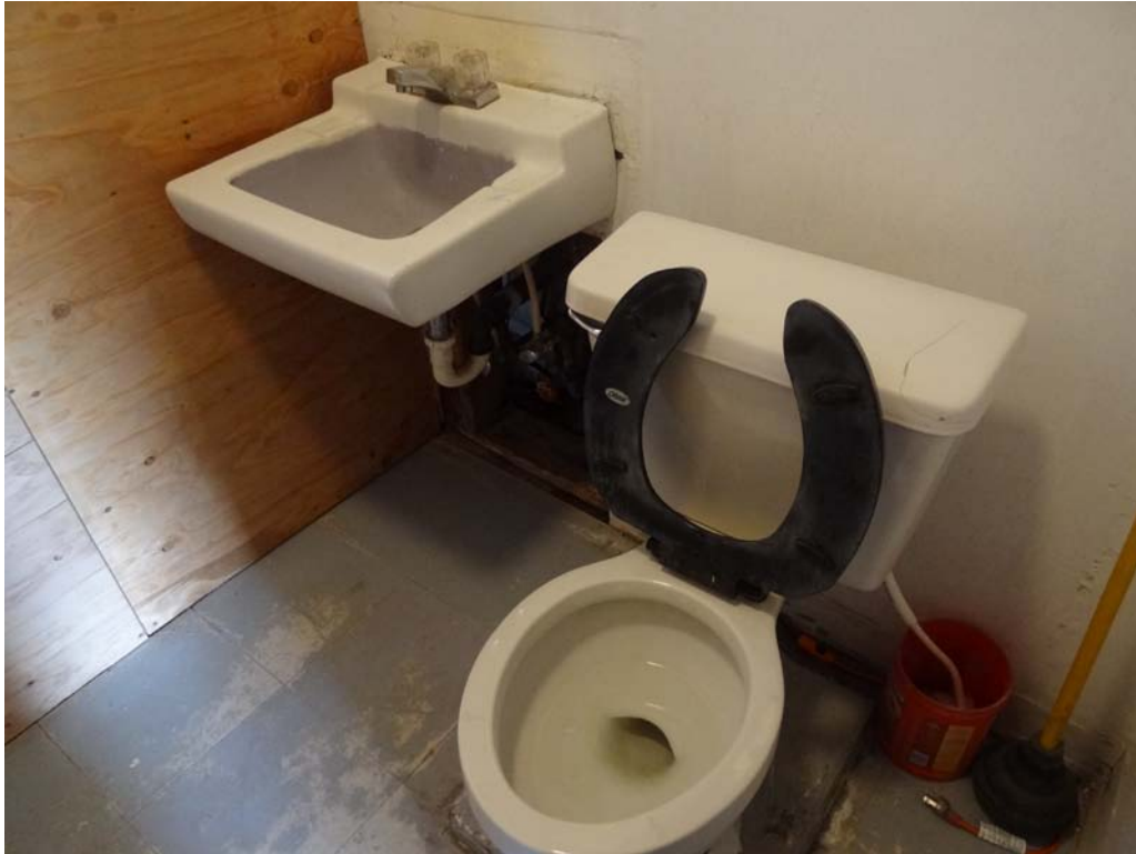
NDF Maintenance Shop - Building #1399 Description: Restroom fixtures.