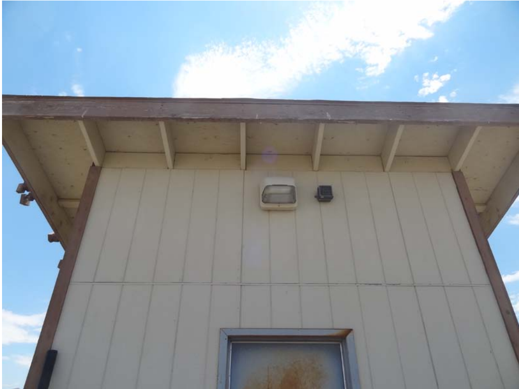
Wastewater Treatment Building - Building #3786 Description: Exterior finishes.