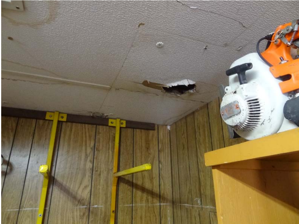
Saw Shop - Building #2138 Description: Interior finishes, water stains from leaking roof.