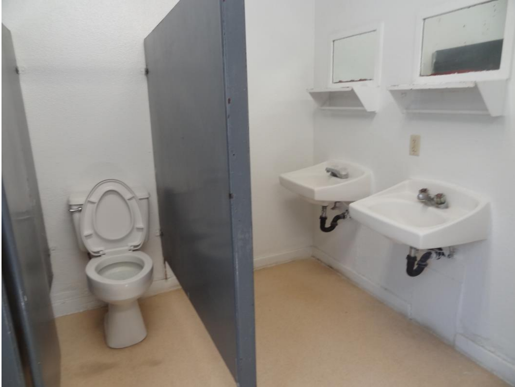
Housing/ Culinary/ Administration - Building #0708 Description: ADA restroom remodel needed.