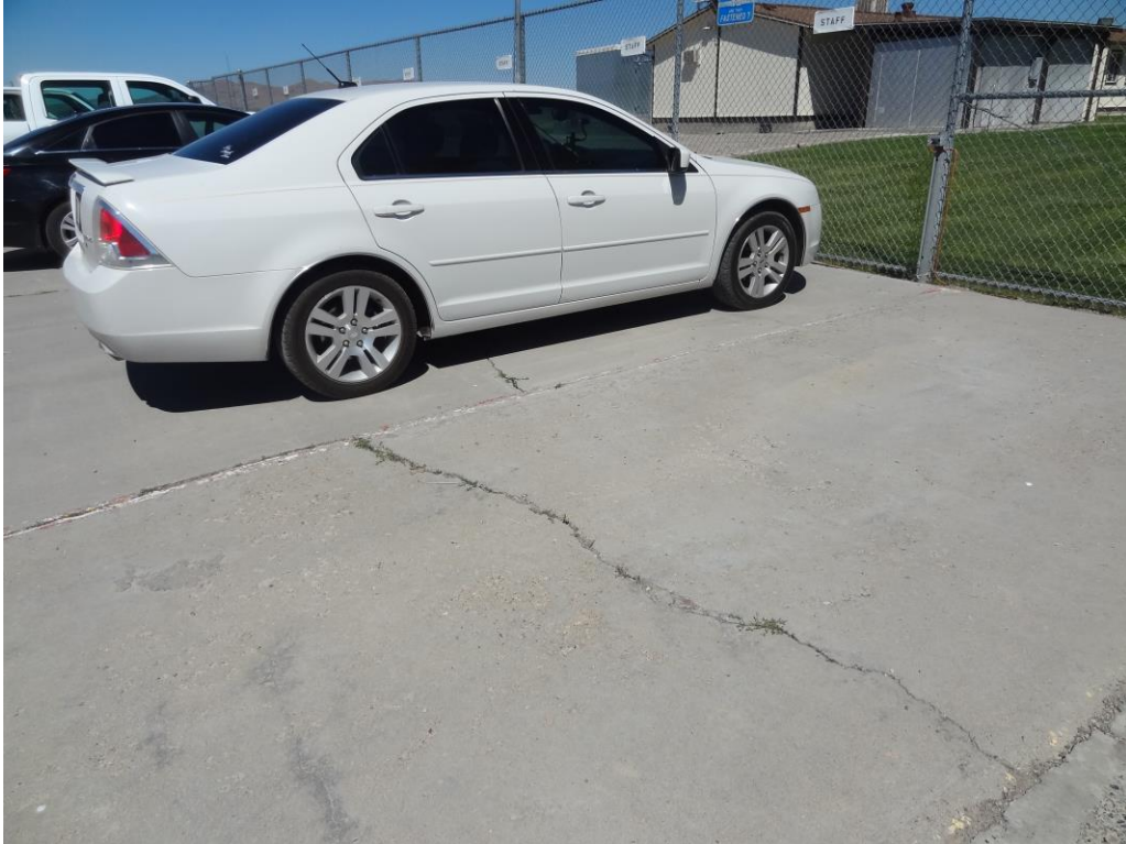
Wells Conservation Camp – Site #9974 Description: ADA accessible path of travel needed.