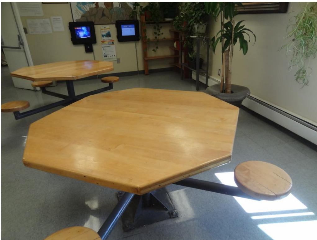
Housing/ Culinary/ Administration - Building #0708 Description: ADA table upgrade needed.