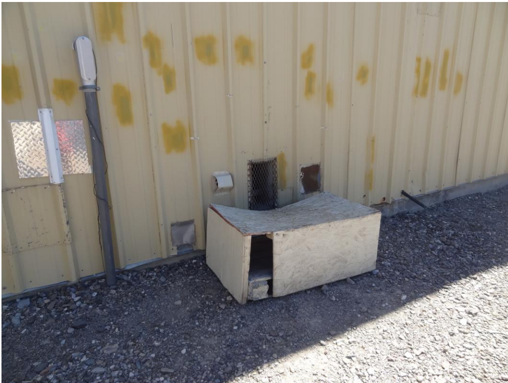
Multi-Purpose/ Gymnasium - Building #1391 Description: Exterior siding replacement needed.