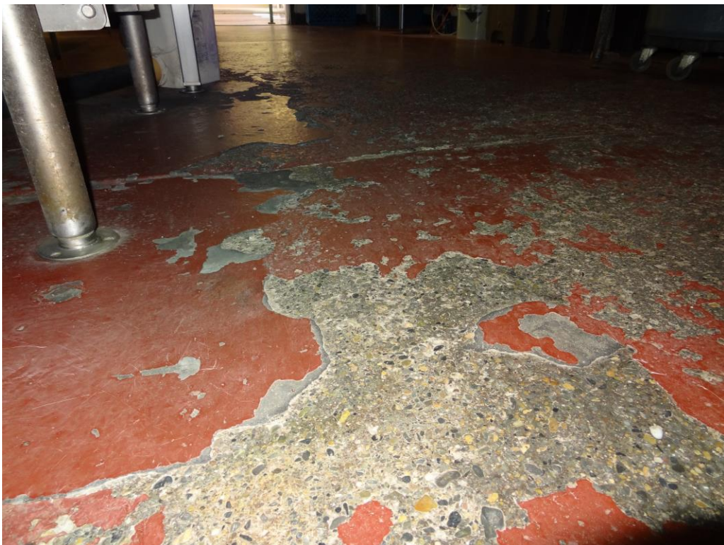
Housing/ Culinary/ Administration - Building #0708 Description: Culinary floor replacement needed.