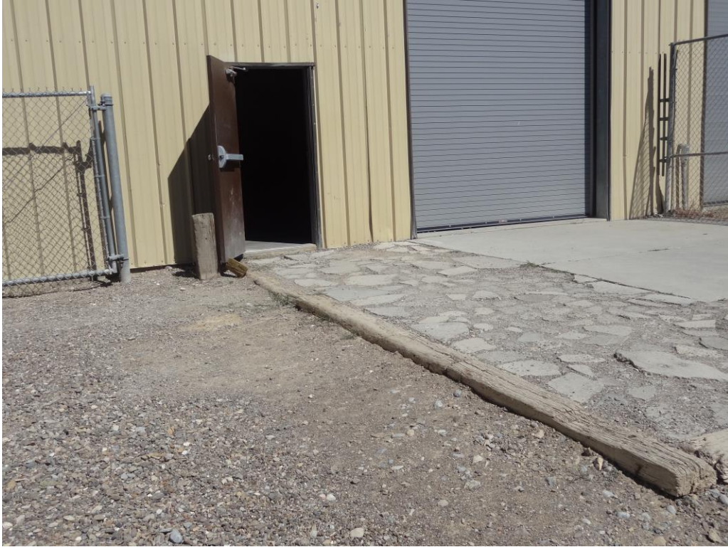
Multi-Purpose/ Gymnasium - Building #1391 Description: Exterior door replacement needed.