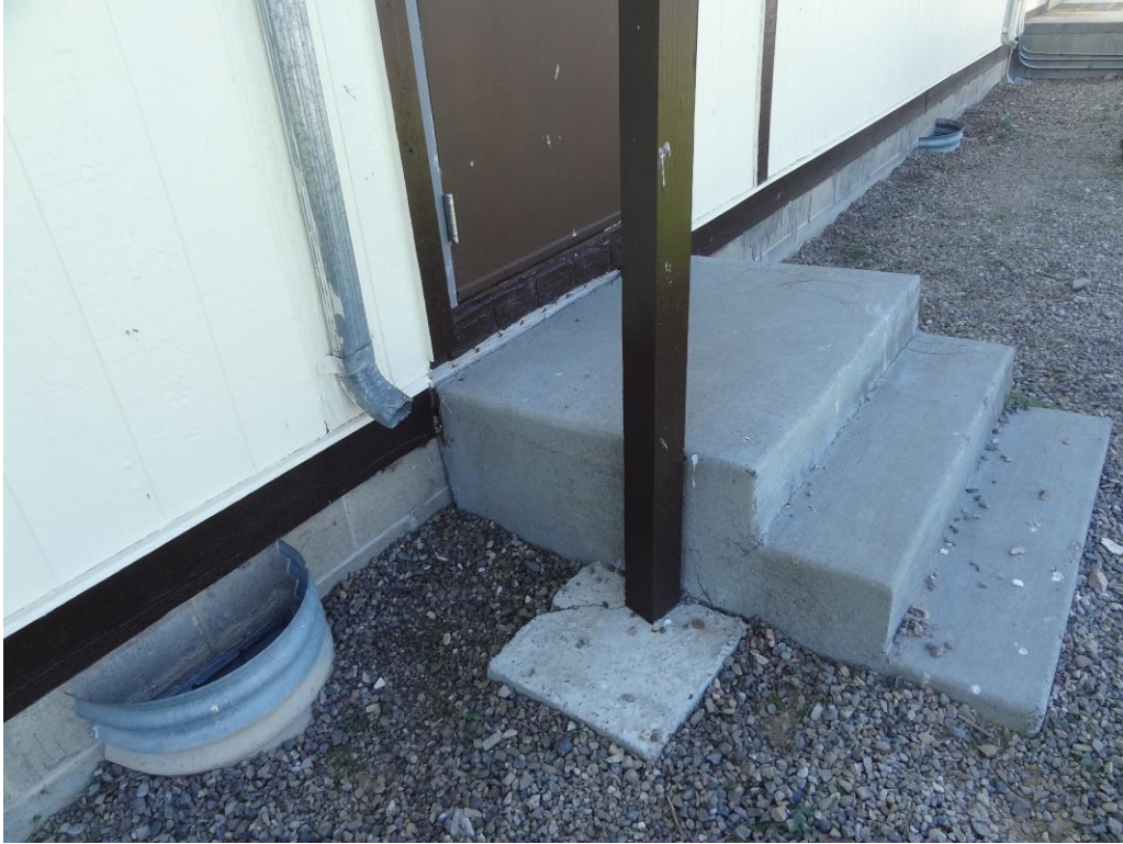
Housing/ Culinary/ Administration - Building #0708 Description: Exterior landing installation needed.