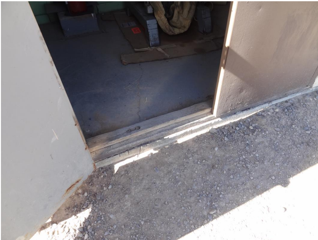
Pump House - Building #2136 Description: Exterior landing installation needed.