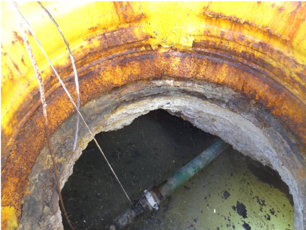
Wells Conservation Camp – Site #9974 Description: Septic system replacement needed.