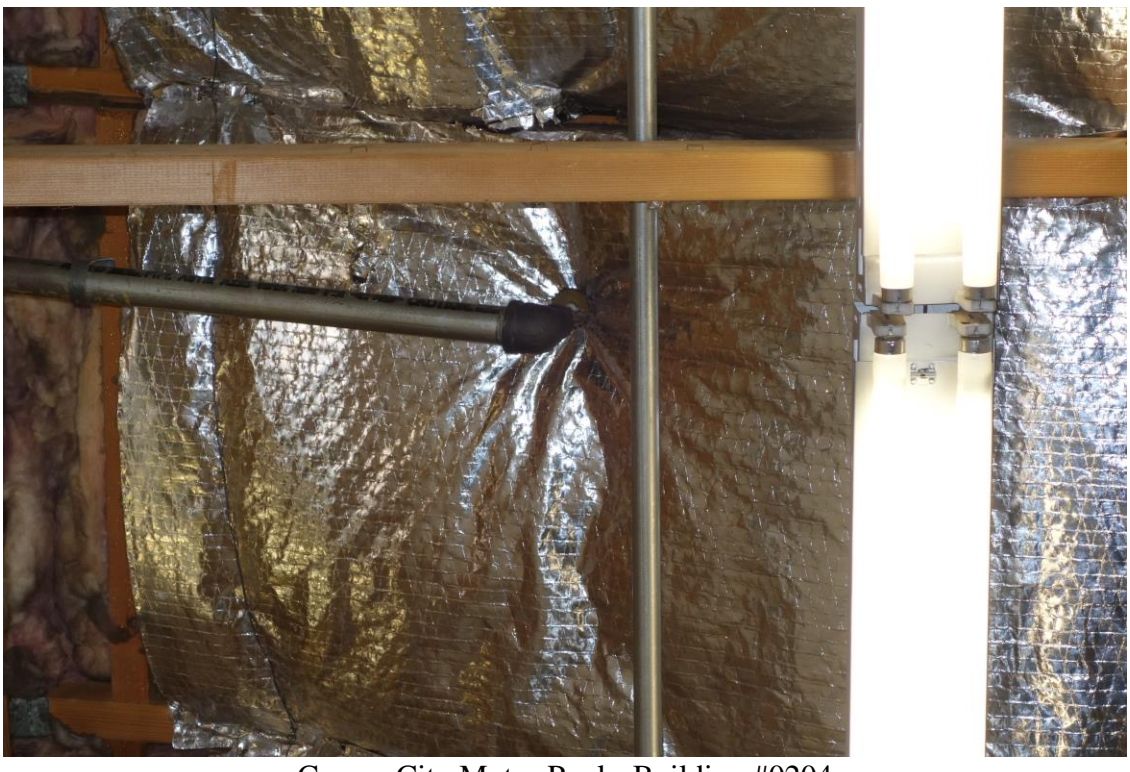
Carson City Motor Pool - Building #0204 Description: Insulation Repairs and Fire Sprinkler Clearance.