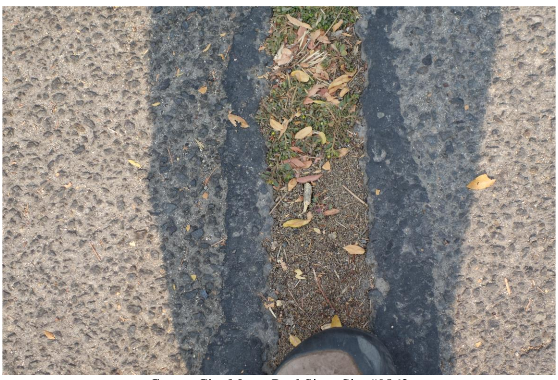
Carson City Motor Pool Site - Site #9862 Description: Parking Pavement Patch, Crack, and Surry Seal.