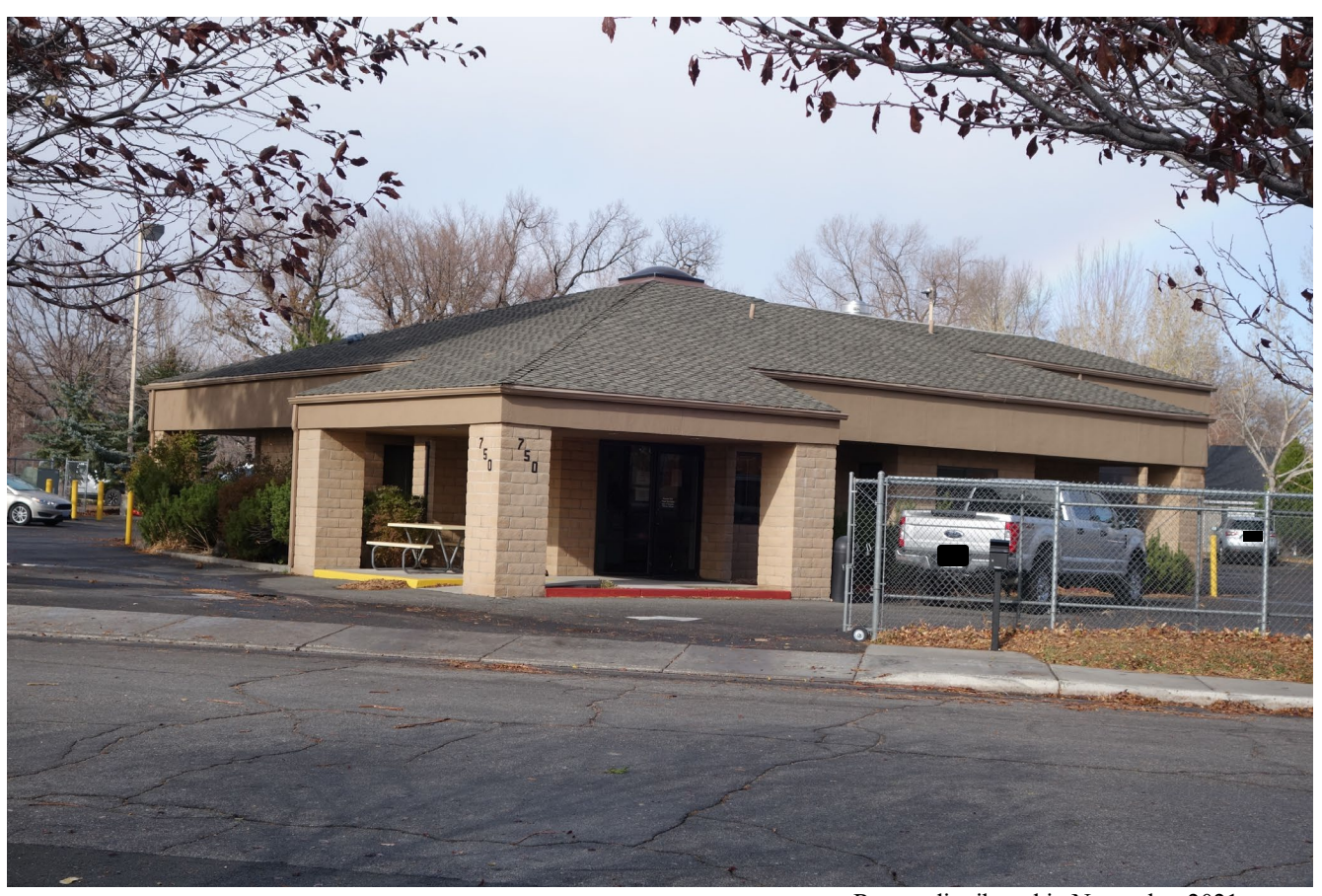
Report distributed in November 2021