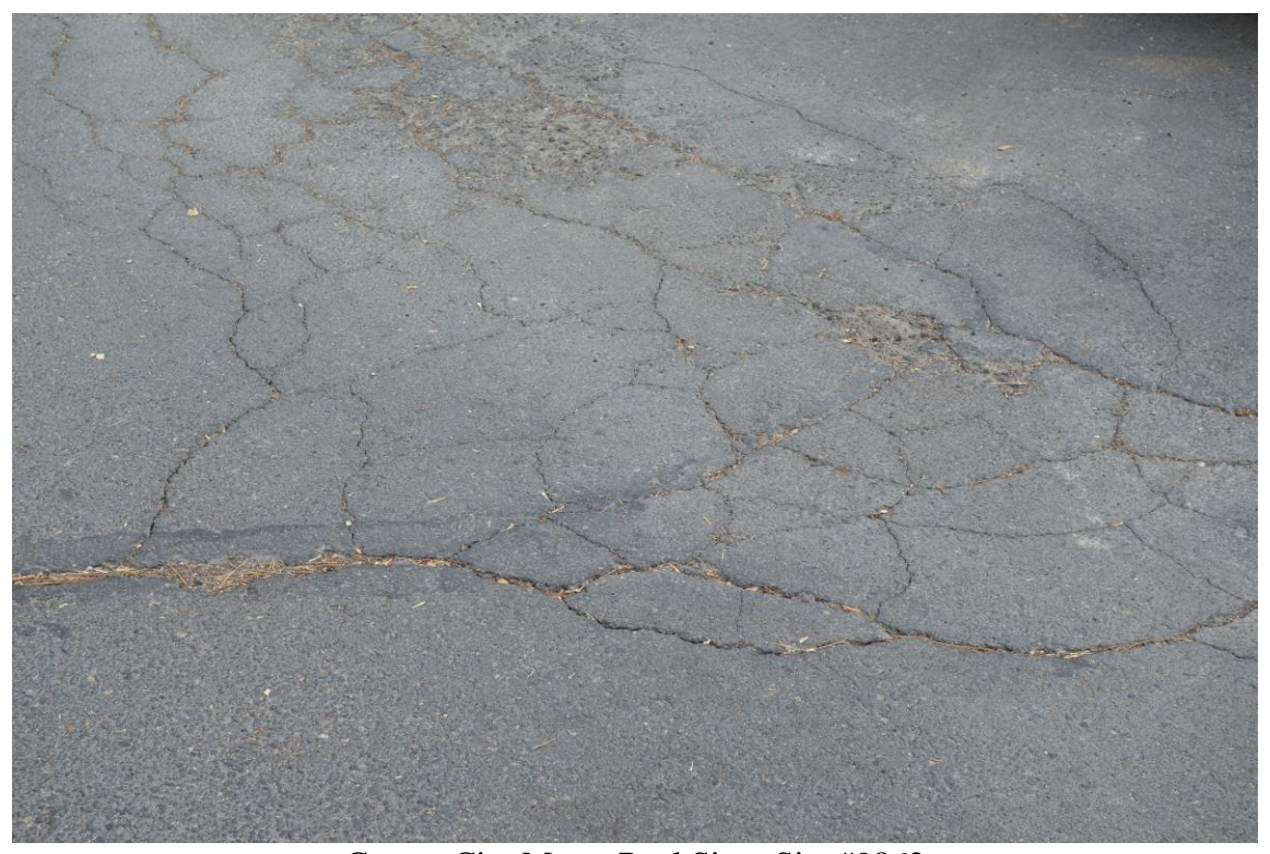
Carson City Motor Pool Site - Site #9862 Description: Failing Parking Pavement.