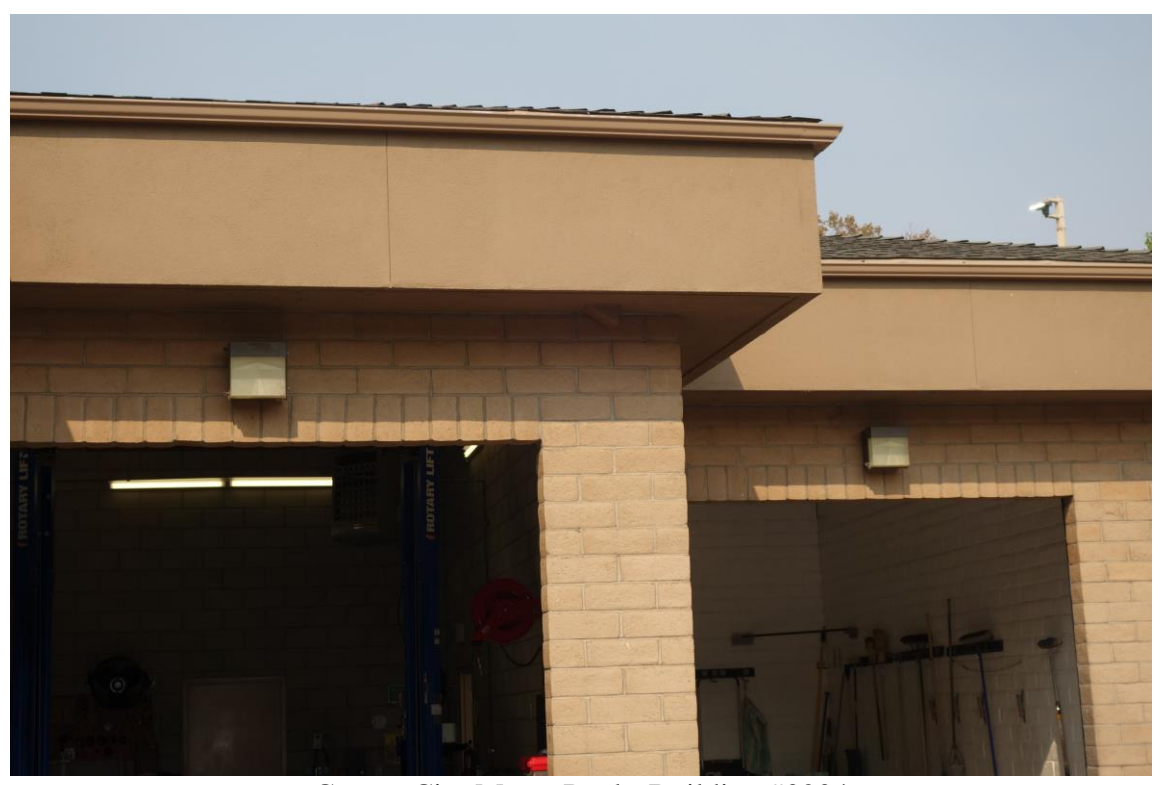
Carson City Motor Pool - Building #0204 Description: Exterior Lighting Replacement.