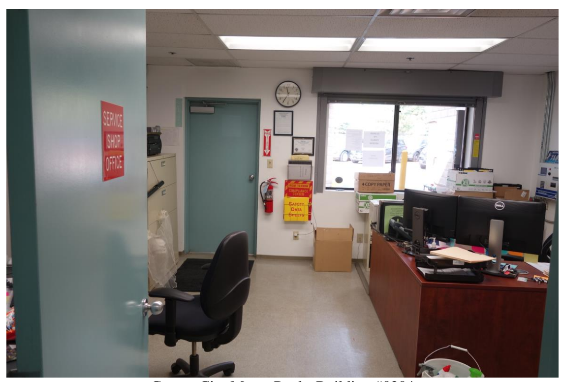
Carson City Motor Pool - Building #0204 Description: Door Lever Hardware Recommendation.