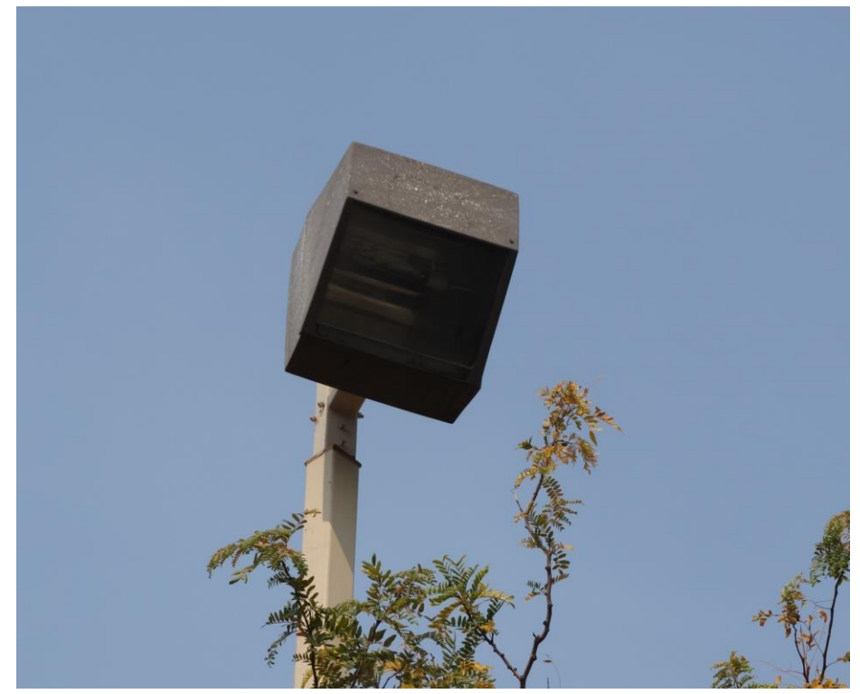
Carson City Motor Pool Site - Site #9862 Description: Exterior Lighting Replacement.