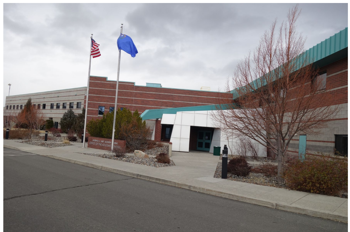
OTAG BLDG / Lawrence E. Jacobsen Center - Building #2199 Description: Exterior of the Building.