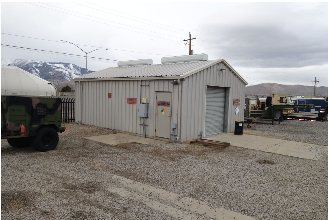
Haz Mat Storage #3 - Building #2518 Description: Exterior of the Building.