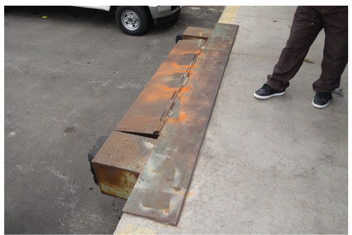
USPFO - Building #0271 Description: Dock Leveler Replacement Needed.