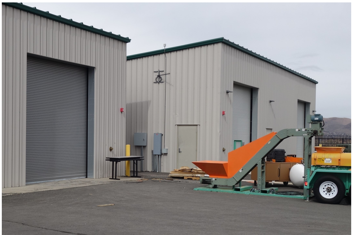
USPFO North – Warehouse #2 - Building #3645 Description: Exterior of the Building.