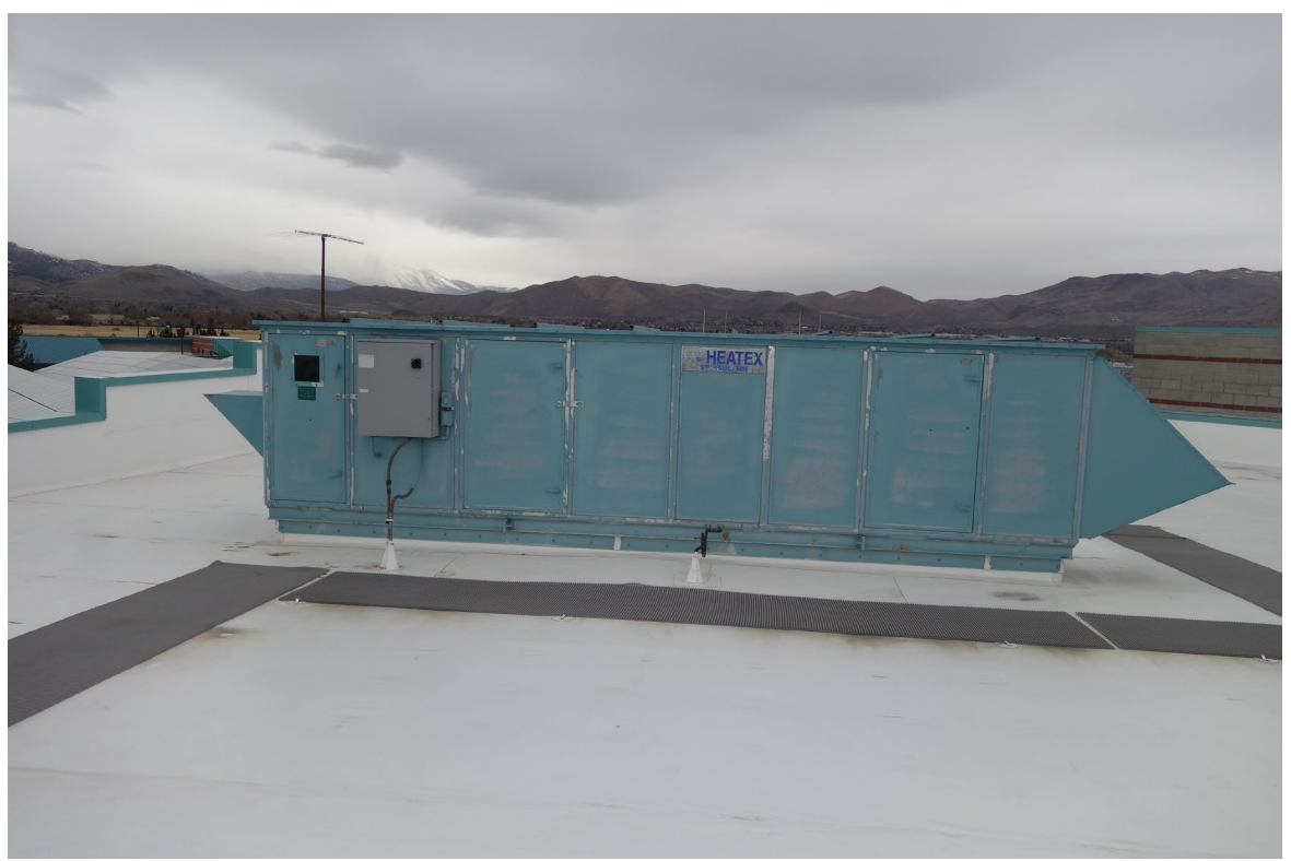
OTAG BLDG / Lawrence E. Jacobsen Center - Building #2199 Description: HVAC Rooftop Equipment Replacement Needed.