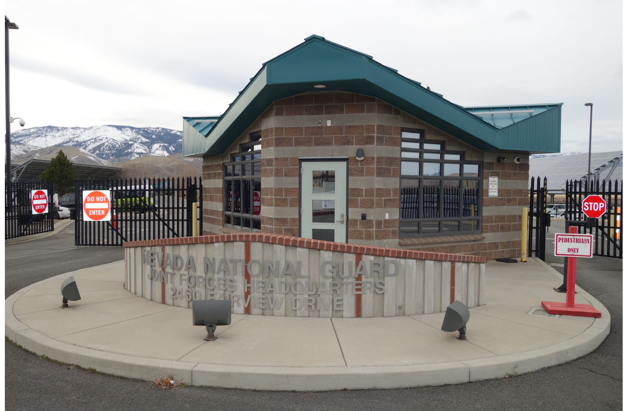
Report distributed in January 2022

Site Number: 9891 STATE OF NEVADA PUBLIC WORKS DIVISION FACILITY CONDITION ANALYSIS