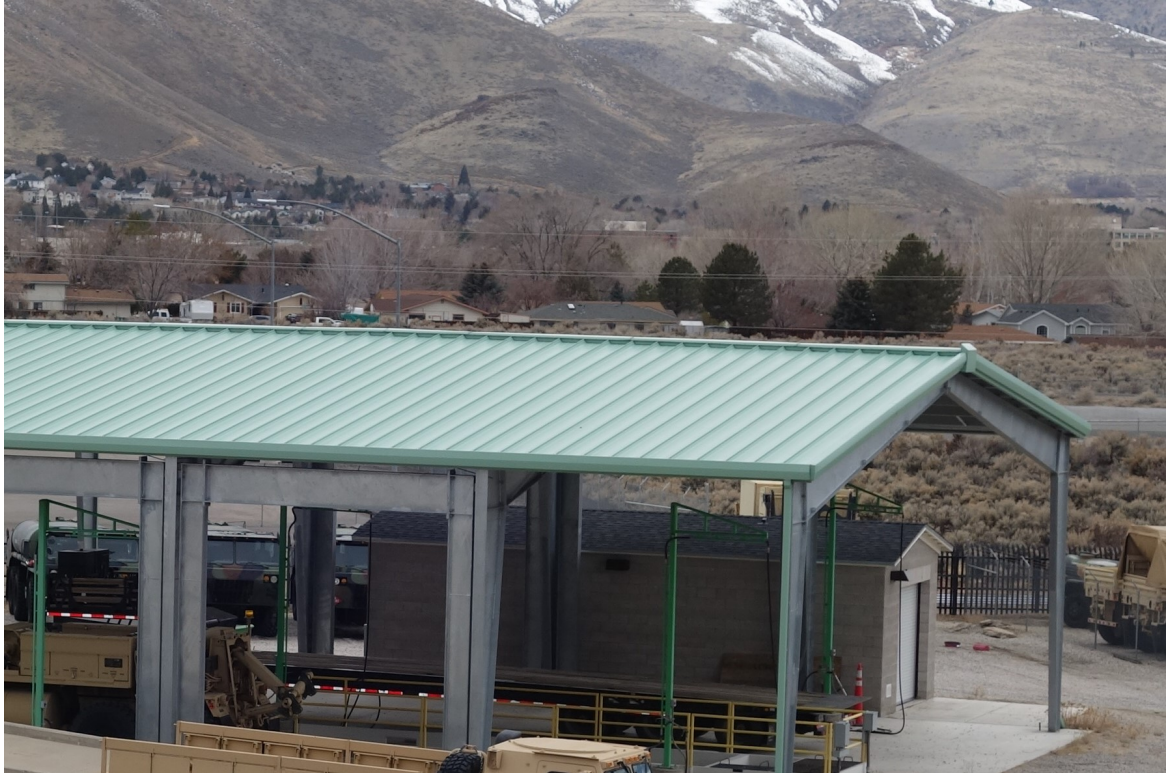
Wash Station Support Building - Building #4169 Description: Exterior of the Building.