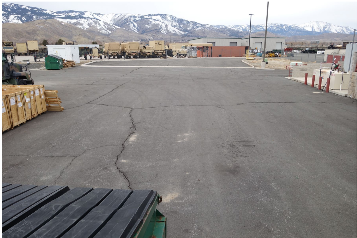
Nevada National Guard Carson City Site - Site #9891 Description: Site Paving Patch, Crack Fill & Slurry Seal Needed.