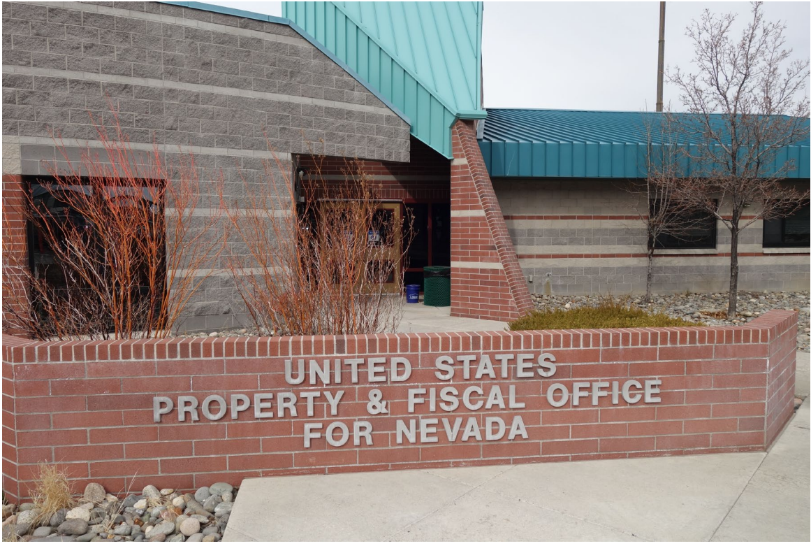
USPFO - Building #0271 Description: Exterior of the Building.