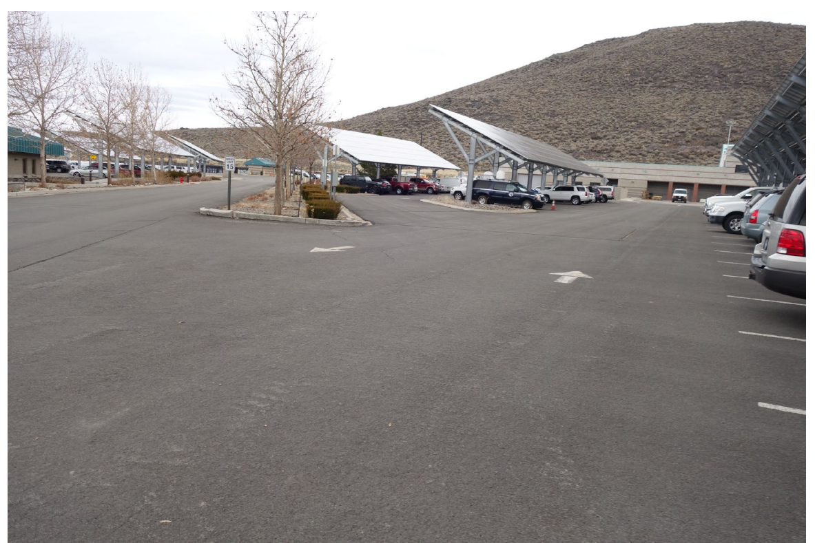
Solar Carport #1- #16 - Buildings #4152 thru #4168 Description: View of Typical Solar Carports.