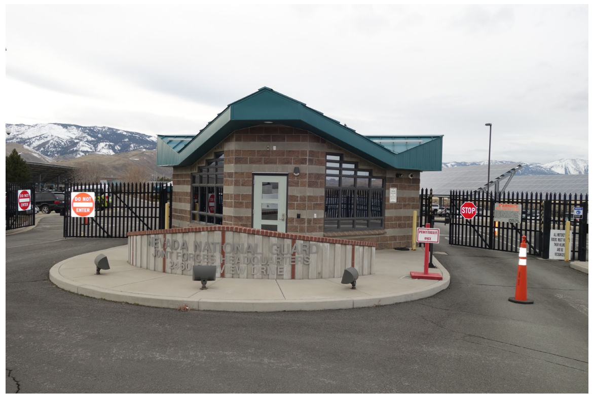
Entrance Guard Station - Building #2987 Description: Exterior of the Building.