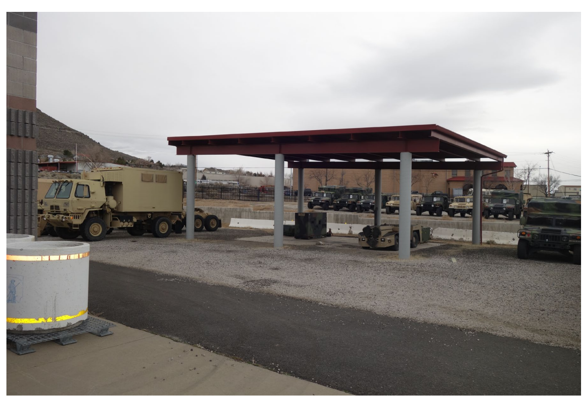
Vehicle Ramada #1 - Building #2521 Description: Exterior of the Structure.