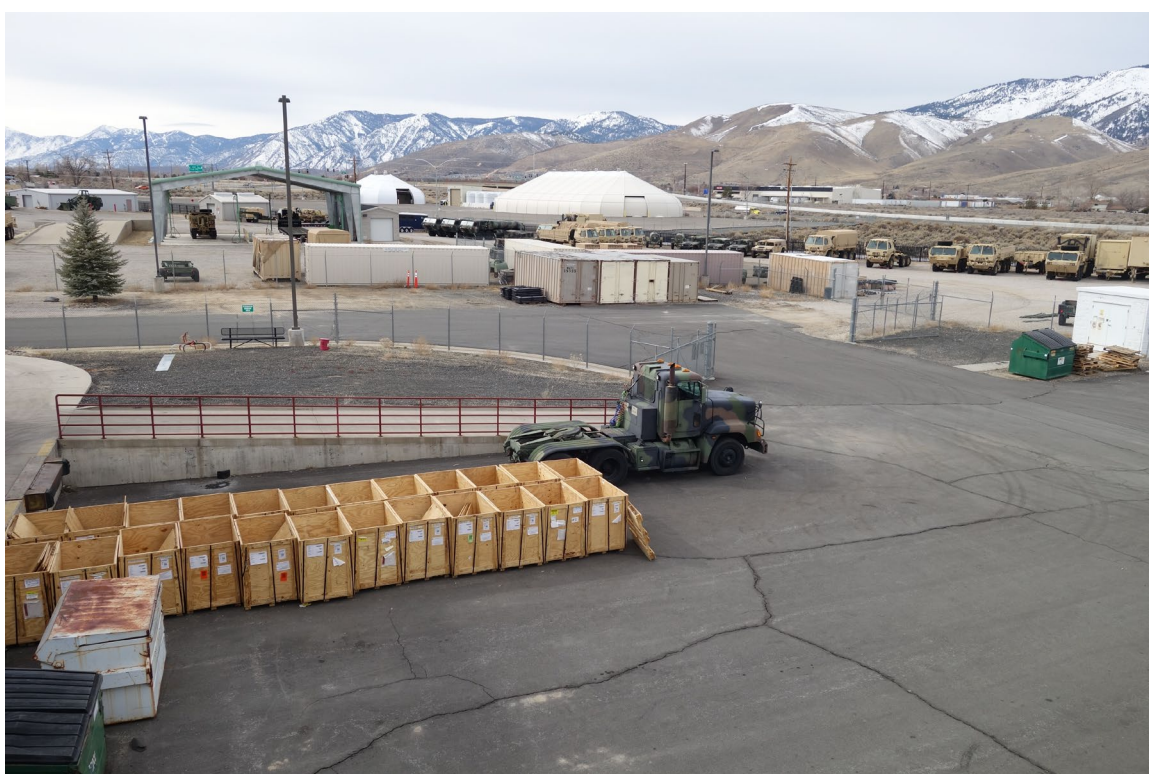
Nevada National Guard Carson City Site - Site #9891 Description: View Southwest Toward Wash Station from USPFO.