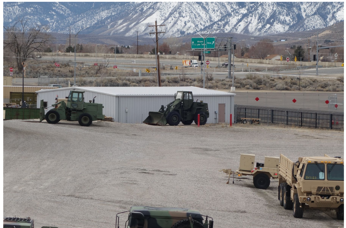
Storage Building - Building #2523 Description: Exterior of the Building.