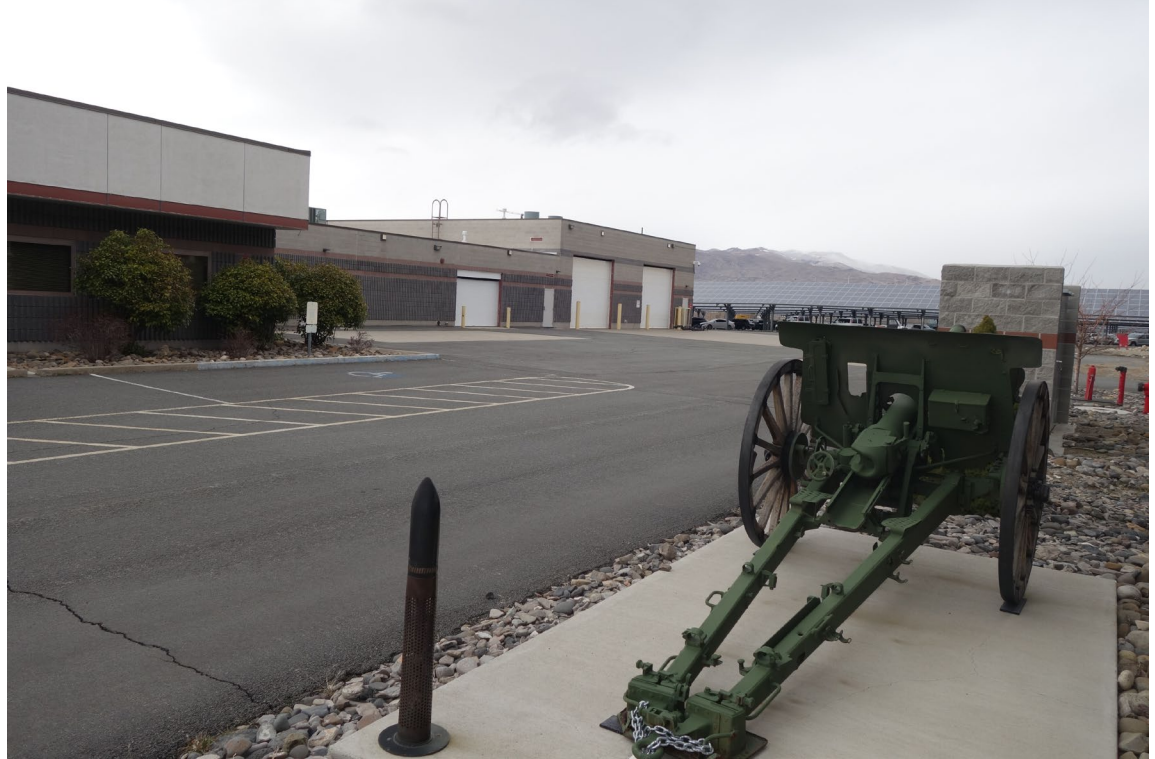
CSMS Building - Building #1676 Description: Exterior of the Building.