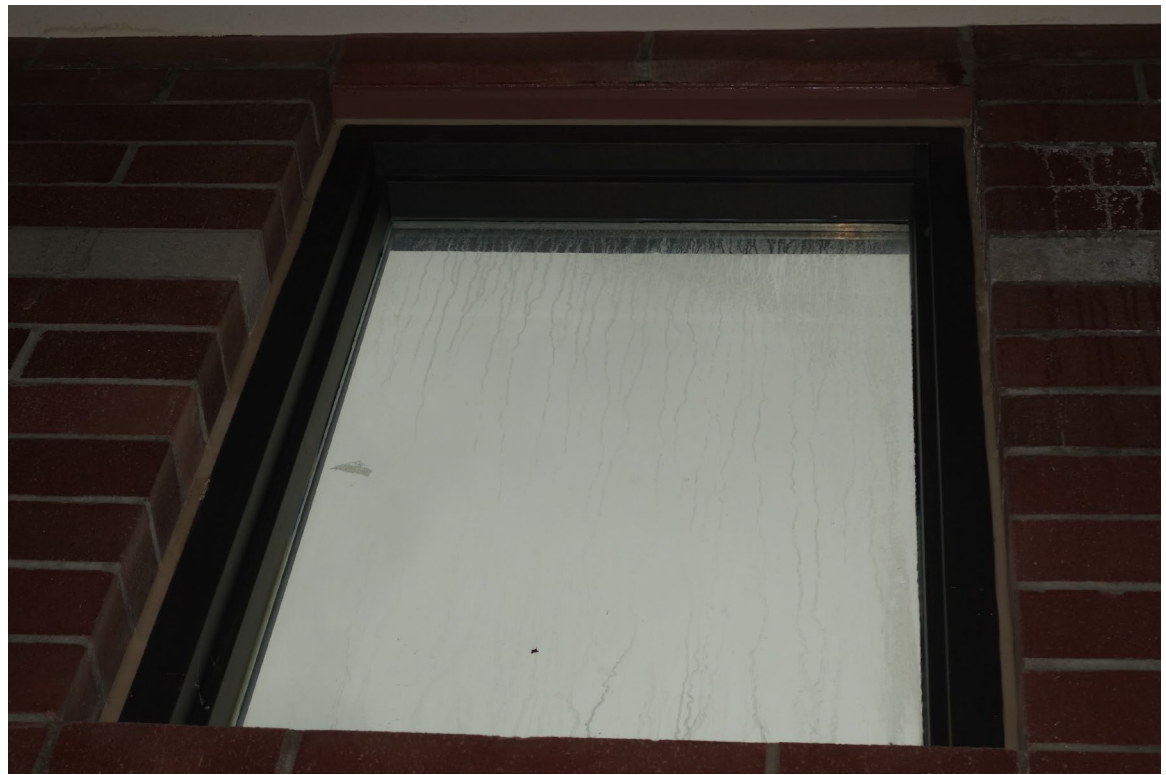
OTAG BLDG / Lawrence E. Jacobsen Center - Building #2199 Description: Window Repair / Replacement Needed.