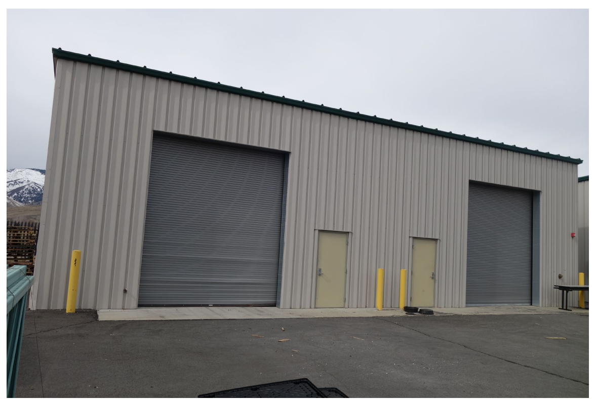
USPFO South – Warehouse #1 - Building #3646 Description: Exterior of the Building.