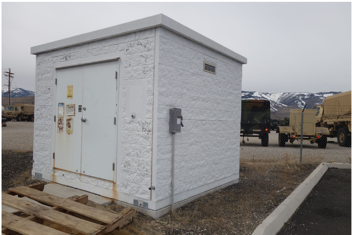
Haz Material Storage #4 - Building #2520 Description: Exterior of the Building.