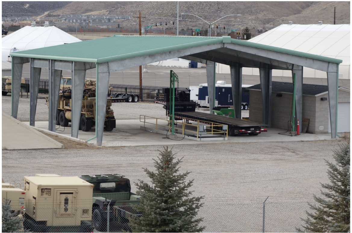
Wash Station Building - Building #4168 Description: Exterior of the Building.