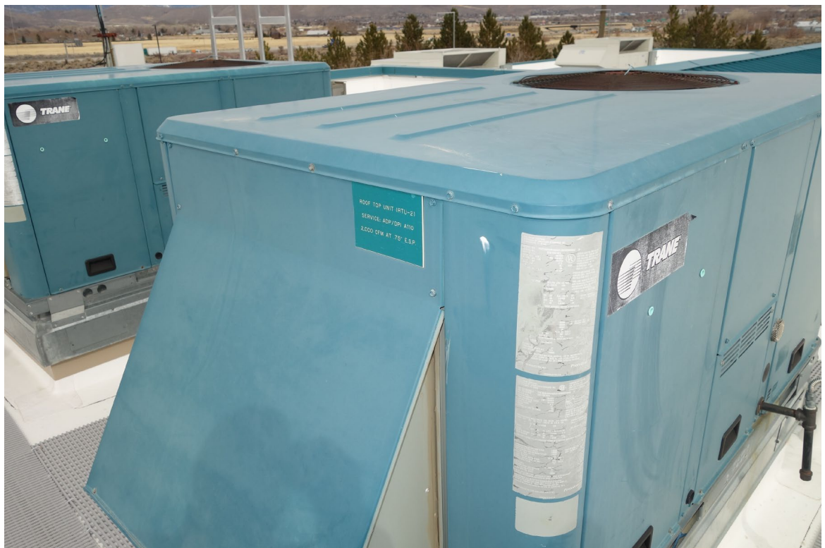
USPFO - Building #0271 Description: HVAC Rooftop Unit Replacement Needed.