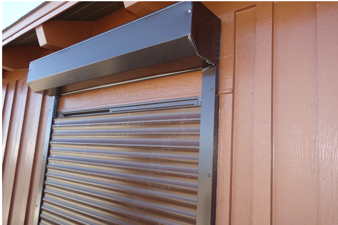
Cave Rock Fee Station – FCA Building #0588 Description: Security Window Sash Repair.