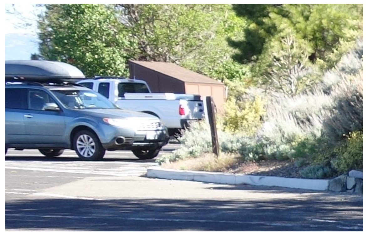
Cave Rock Storage Shed – FCA Building #0586 Description: Exterior of the building.