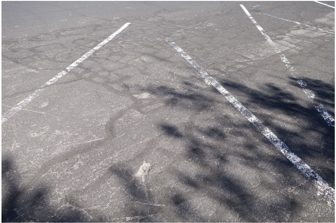
Lake Tahoe Nevada State Park – Cave Rock Site – FCA Site #9926 Description: Paving Crack Fill & Seal.