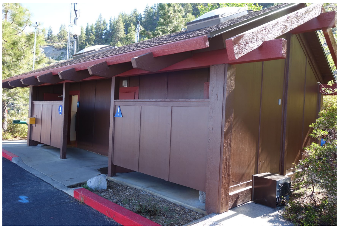
Cave Rock Comfort Station – FCA Building #0597 Description: Non-ADA compliant entrance.