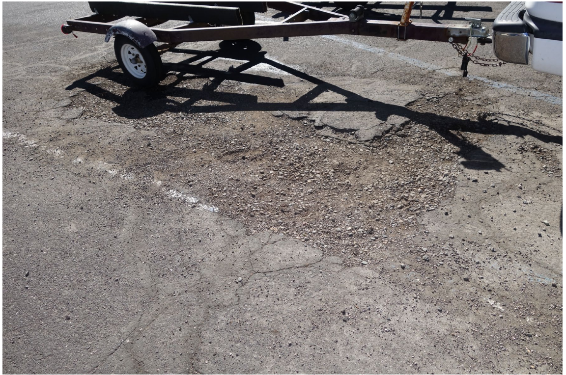
Lake Tahoe Nevada State Park – Cave Rock Site – FCA Site #9926 Description: Crack Fill & Seal - Paving Repair.