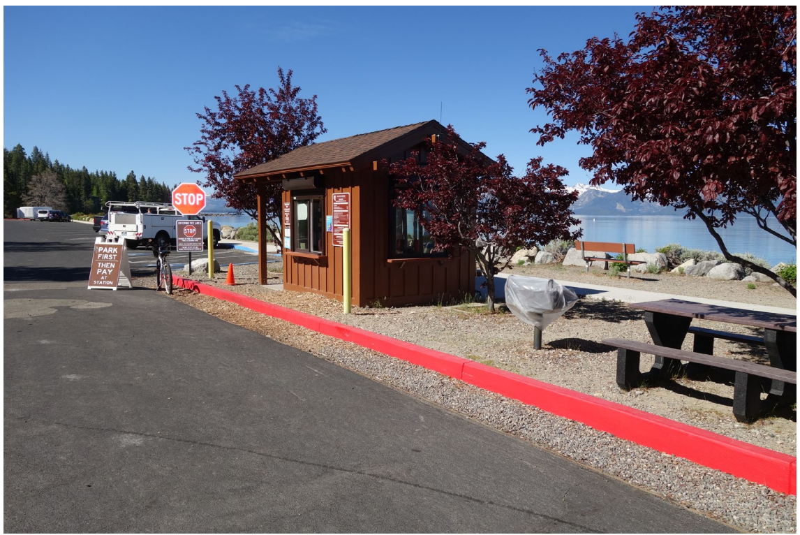
Cave Rock Fee Station – FCA Building #0588 Description: Exterior of the building.