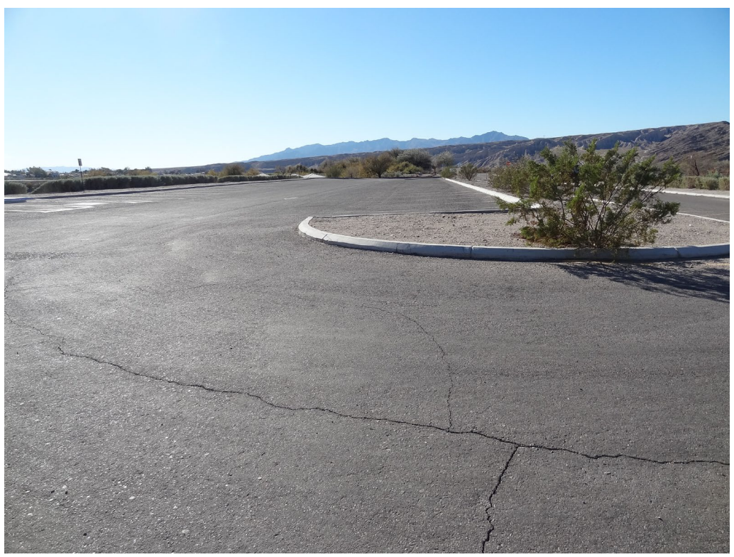
Big Bend State Recreation Area - Site #9931 Description: Seal Asphalt Paving.