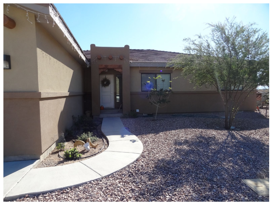
Ranger Residence #1 - Building #1907 Description: Exterior of the Building.