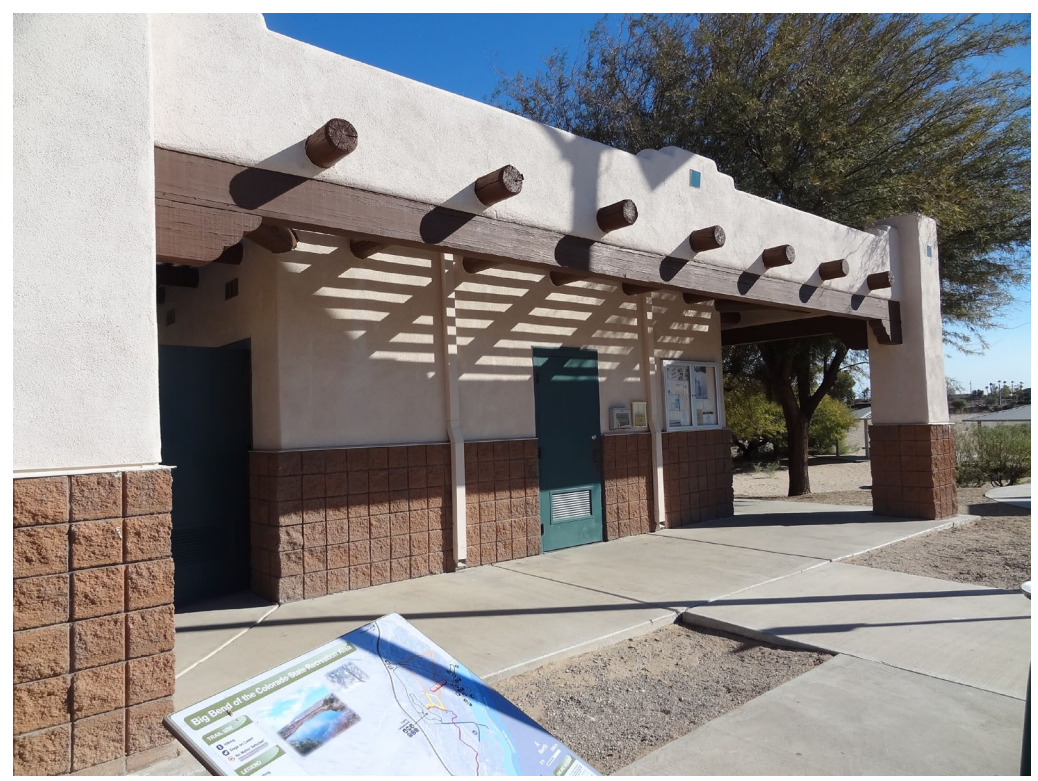
Comfort Station #1 - Building #1908 Description: Exterior of the Building.