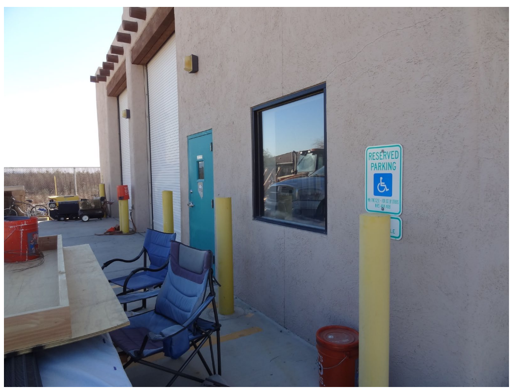
Shop / Maintenance Building - Building #2349 Description: Exterior of the Building.