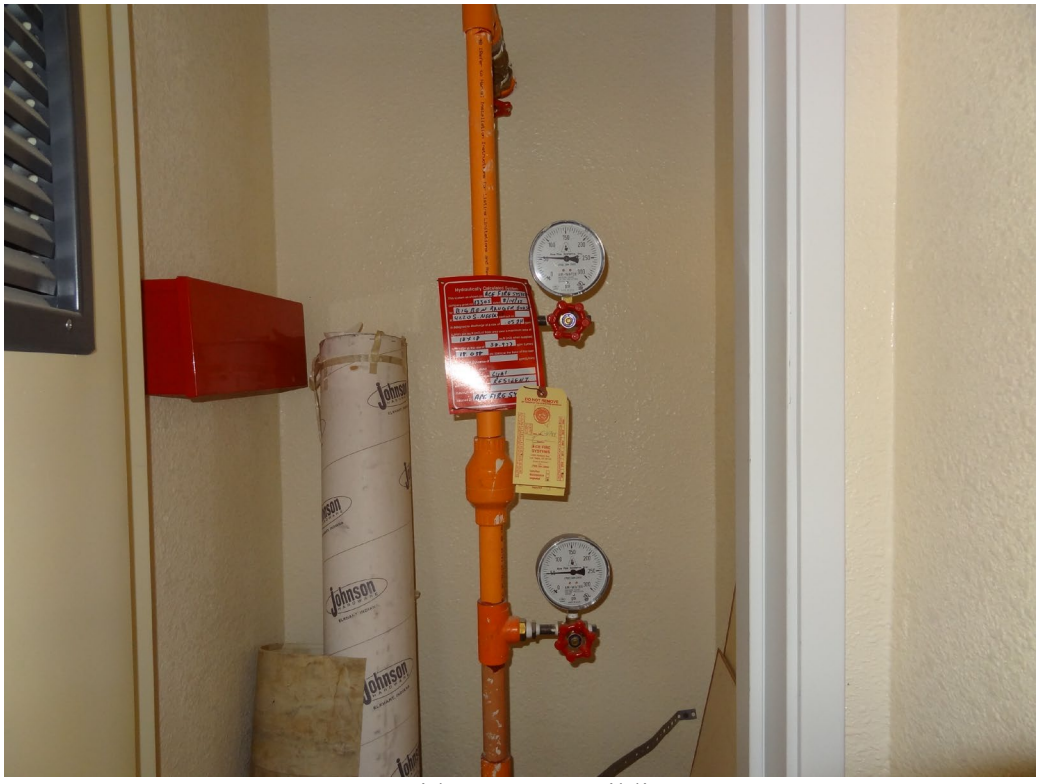
Ranger Residence #1 - Building #1907 Description: View of Fire Suppression Riser.