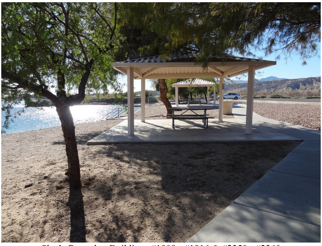
Shade Ramada - Buildings #1909 - #1916 & #2350 - #2360 Description: Typical Shade Ramadas in Day Use Area.