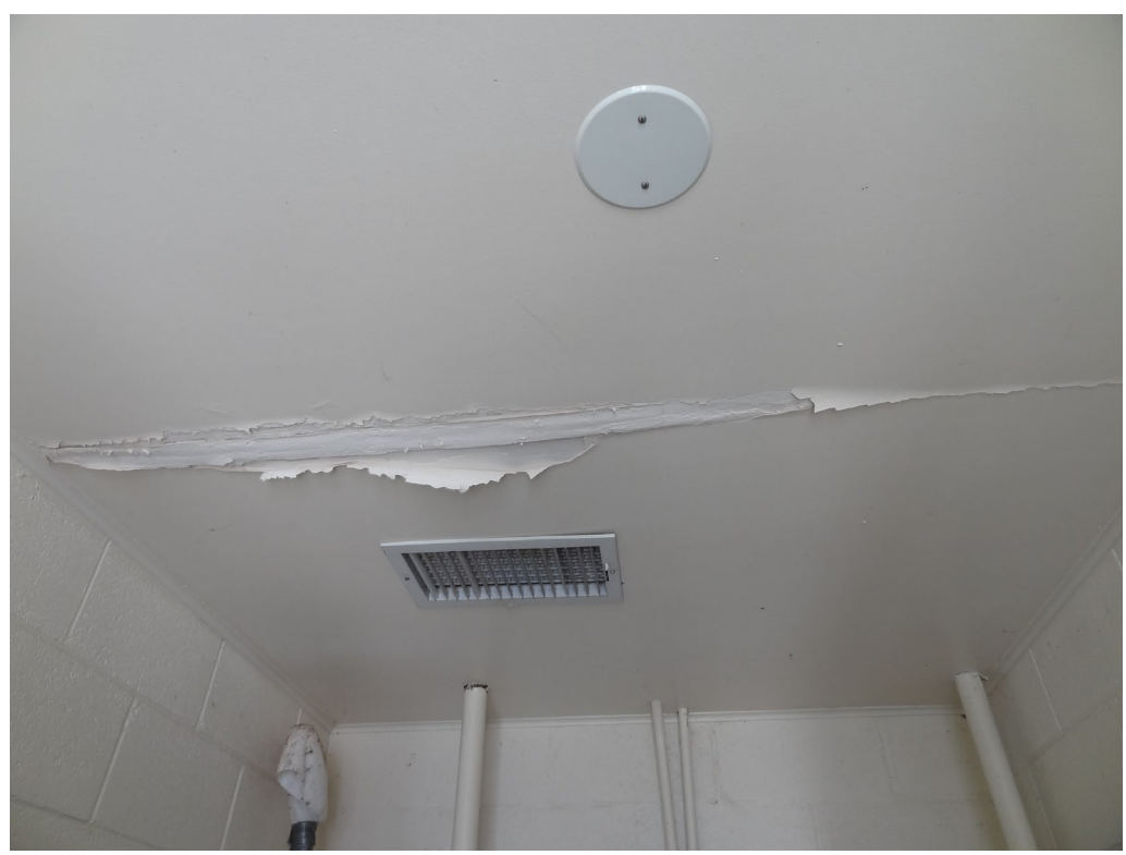
Comfort Station #1 - Building #1908 Description: Gypsum Board Repair.