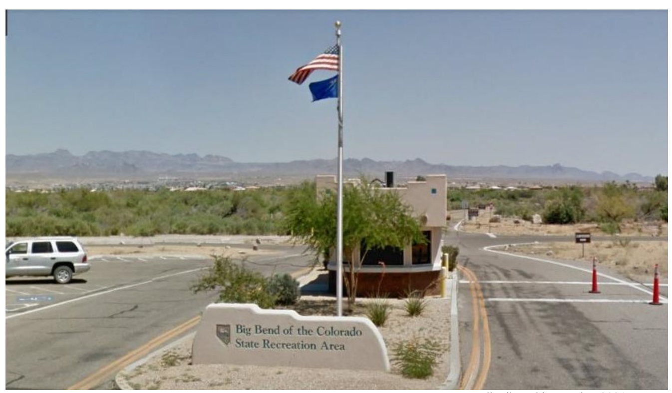
Report distributed in October 2021