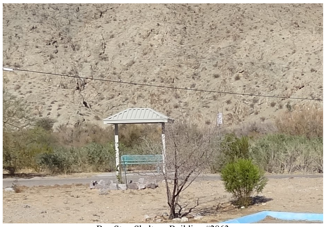
Bus Stop Shelter - Building #2863 Description: Exterior of the Structure.