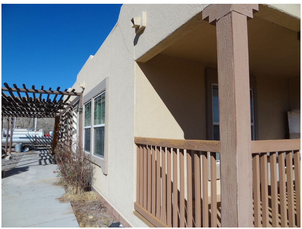
Ranger Residence #2 - Building #2861 Description: Exterior of the Building.