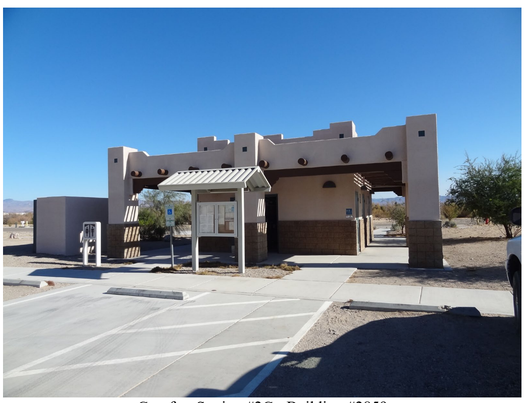
Comfort Station #2C - Building #2859 Description: Exterior of the Building.