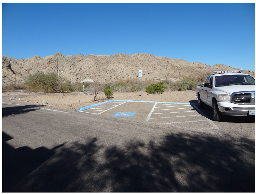
Big Bend State Recreation Area - Site #9931 Description: ADA Accessible Parking at the Entrance Station Parking Area.