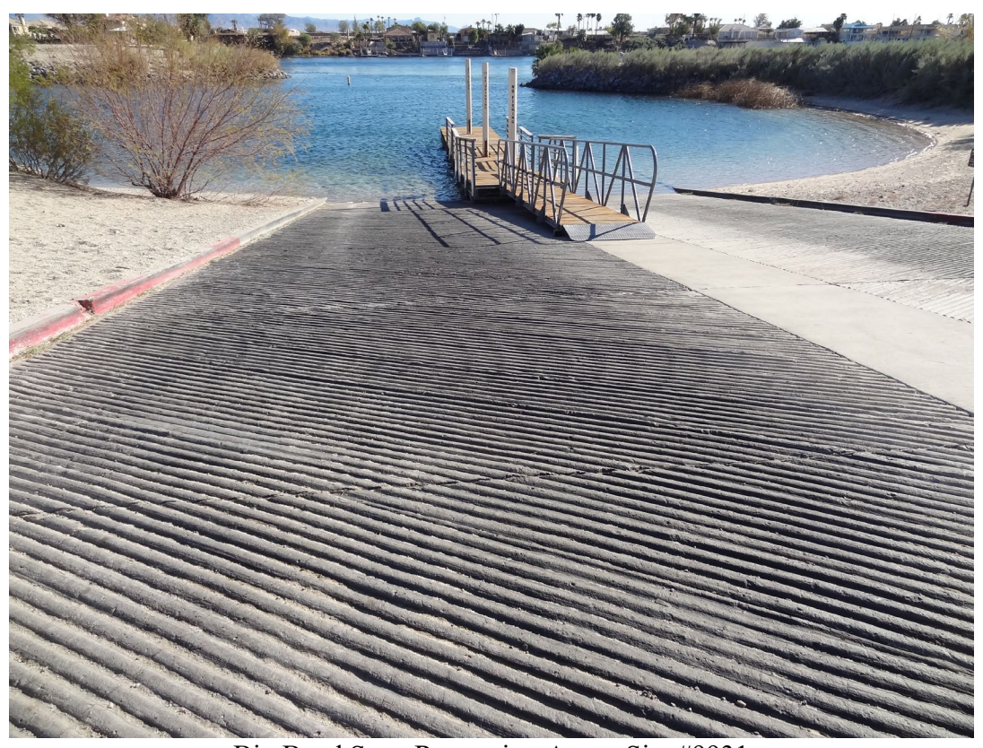
Big Bend State Recreation Area - Site #9931 Description: View of Dock at Boat Ramp with New Decking.