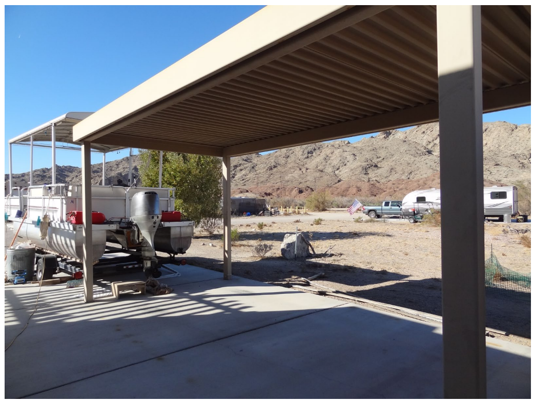
Ranger Residence #2 Carport - Building #2862 Description: View of the Building.