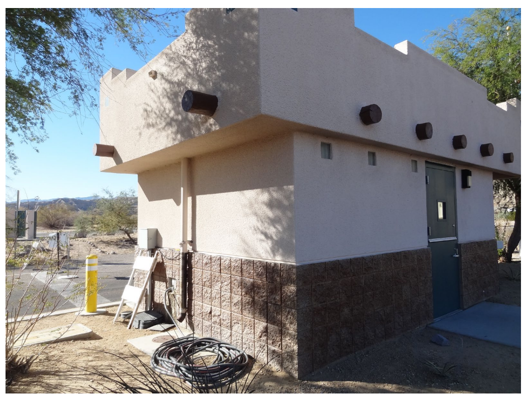
Entrance Station - Building #2860 Description: Exterior of the Building.