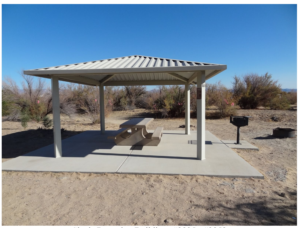
Shade Ramada - Buildings #2835 - #2858 Description: Typical Shade Ramada in Campground.