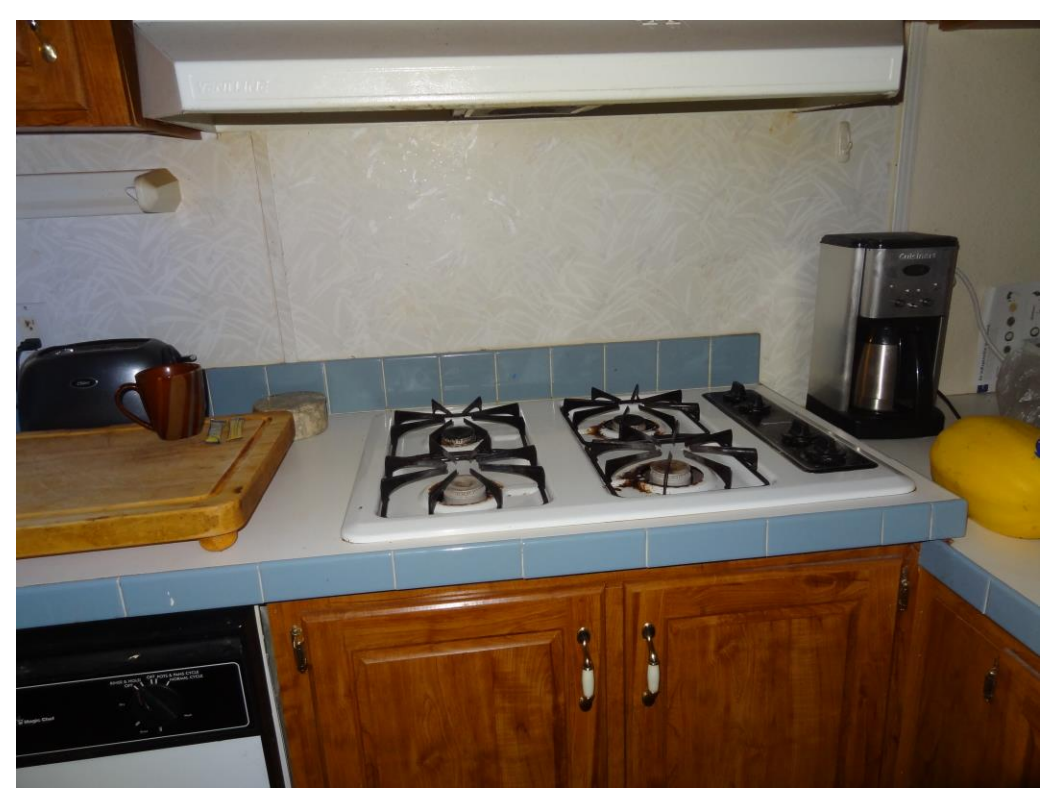
Park Residence - Building #2252 Description: Residential kitchen due for a remodel.