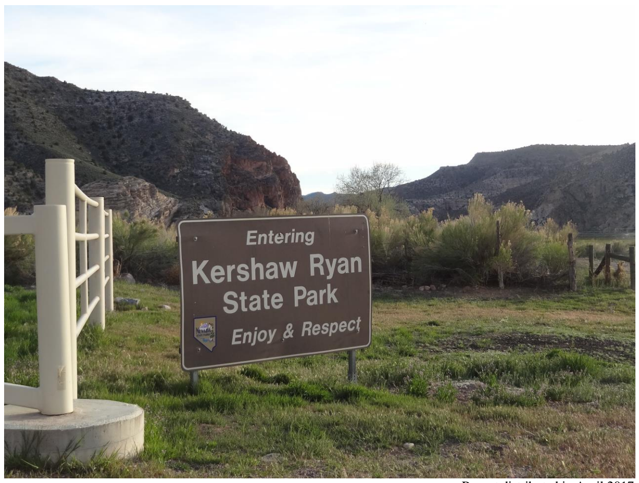
Report distributed in April 2017

Site Number: 9944 STATE OF NEVADA PUBLIC WORKS DIVISION FACILITY CONDITION ANALYSIS