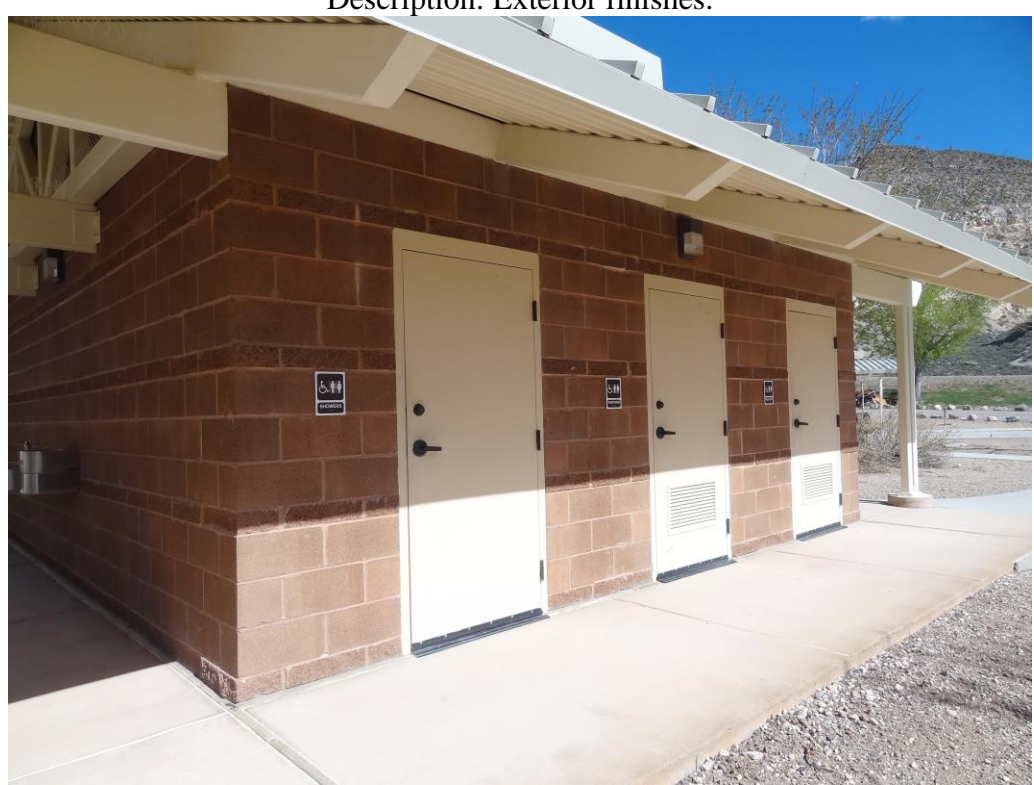
Comfort Station #2 - Lower - Building #2934 Description: Exterior finishes.

Generator Building - Building #3685 Description: Exterior finishes.