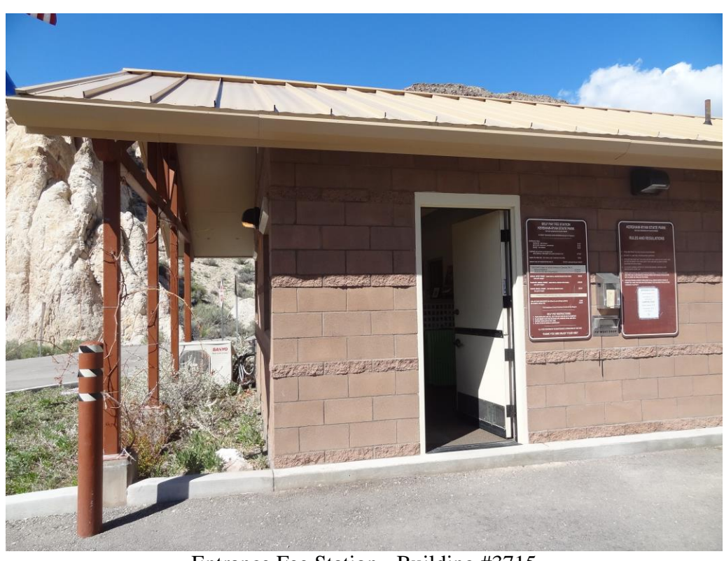
Entrance Fee Station - Building #3715 Description: Exterior finishes.