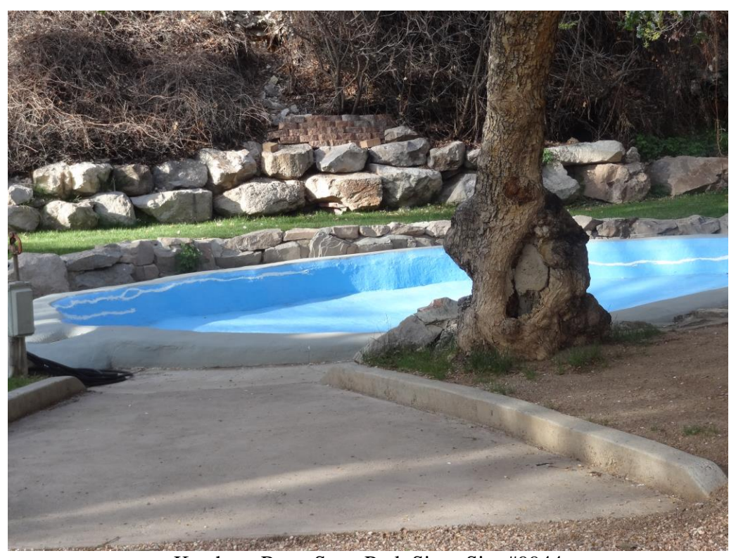
Kershaw-Ryan State Park Site - Site #9944 Description: Outdoor wading pool in need of ADA Upgrades.