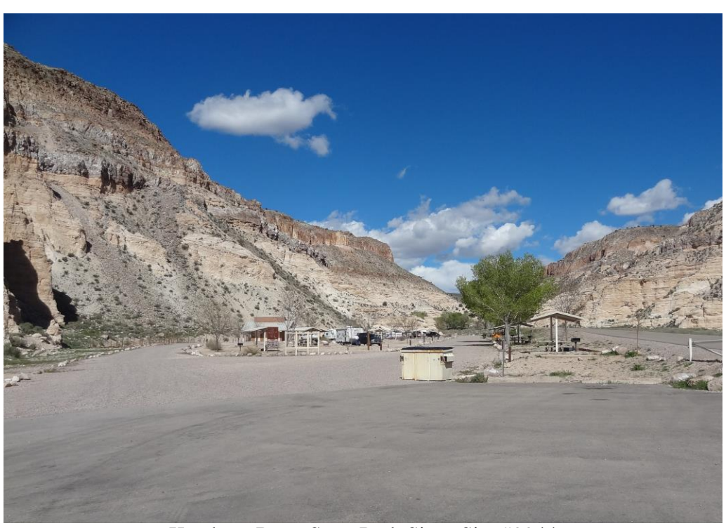
Kershaw-Ryan State Park Site - Site #9944 Description: New campground with shade ramadas and a comfort station.