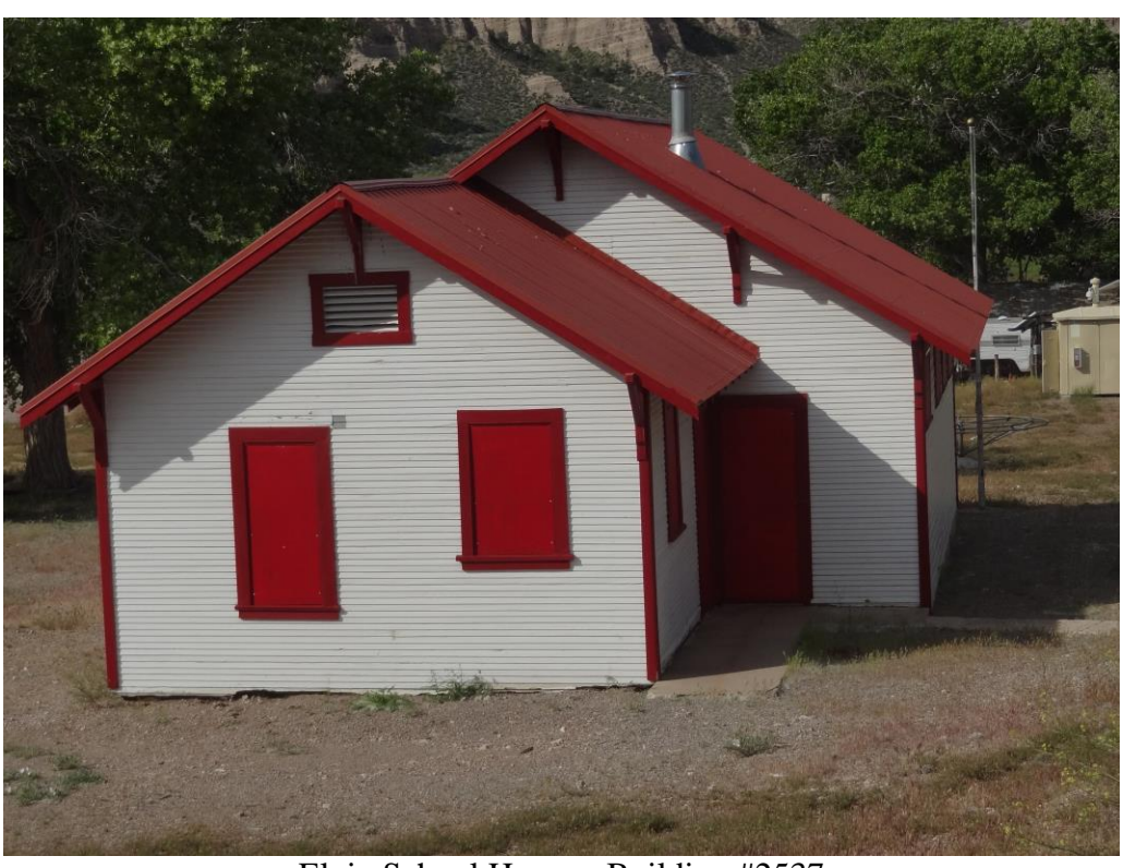
Elgin School House - Building #2537 Description: Rear addition in need of a concrete foundation.