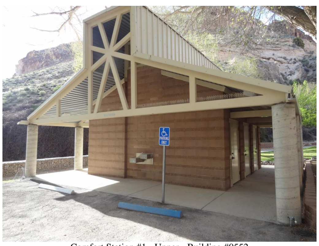
Comfort Station #1 - Upper - Building #0552 Description: Exterior finishes and ADA parking space.