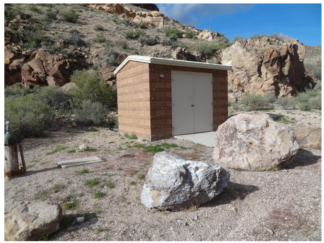
Pump House - Building #3716 Description: Exterior finishes.