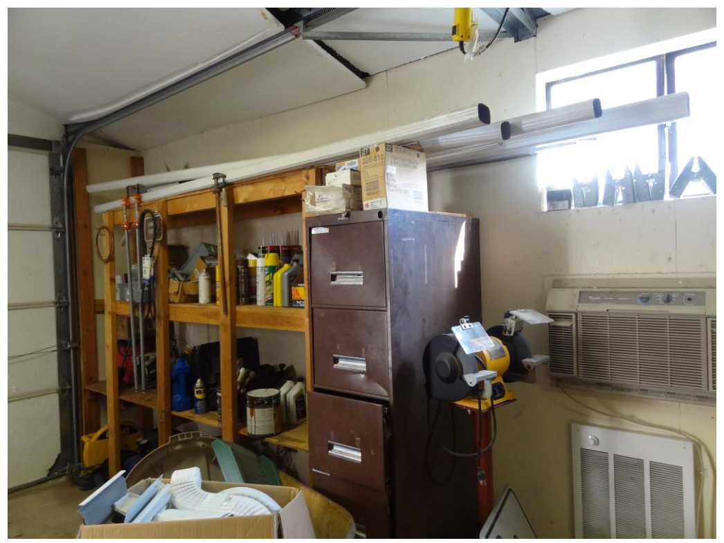
Park Maintenance Building - Building #2930 Description: Interior finishes.