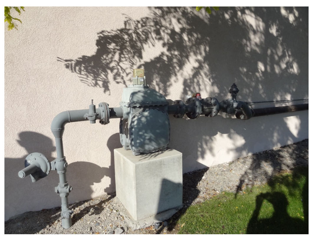
Lakes Crossing Center Site - Site #9980 Description: Bollard Protection Needed.