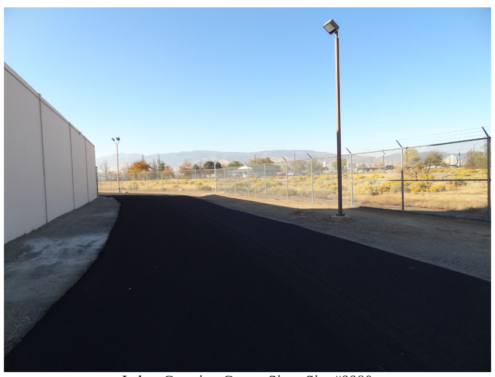
Lakes Crossing Center Site - Site #9980 Description: Exterior Site Lighting Upgrade Needed.