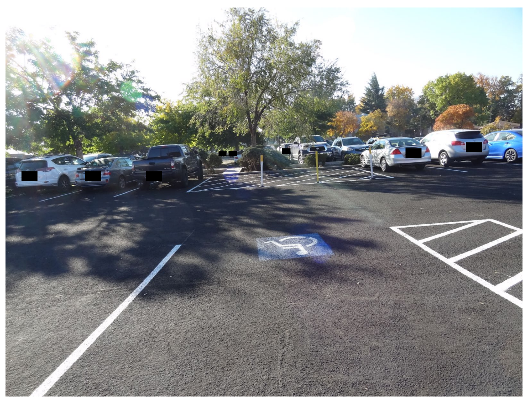
Lakes Crossing Center Site - Site #9980 Description: ADA Accessible Parking & Slurry Seal and Striping.