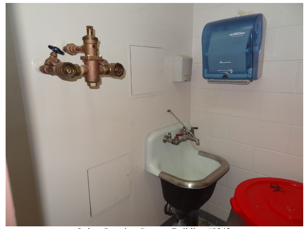
Lakes Crossing Center - Building #0342 Description: Janitor's Closet Repairs – FRP Sink Splash Protection Needed.