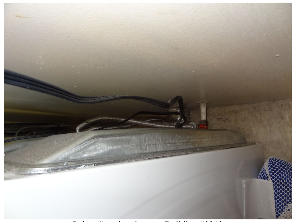
Lakes Crossing Center - Building #0342 Description: Laundry Dryer Replacement – Gas is Source to Start Fires.