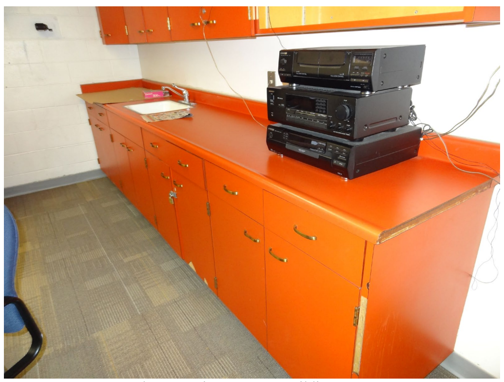
Lakes Crossing Center - Building #0342 Description: ADA Cabinetry & Sink Upgrade.