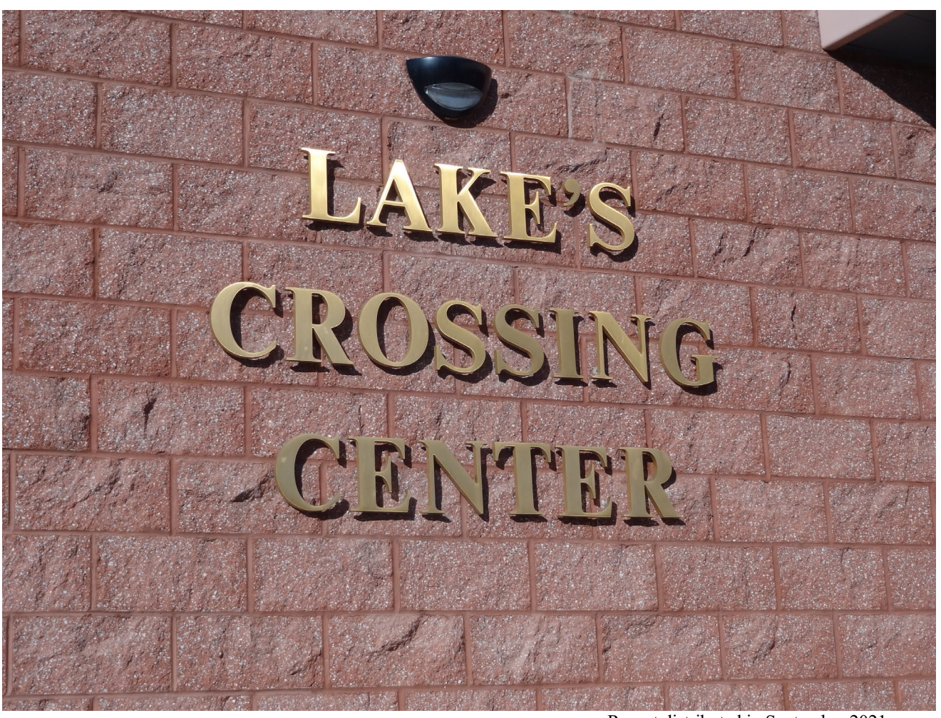
Report distributed in September 2021

Site Number: 9980 STATE OF NEVADA PUBLIC WORKS DIVISION FACILITY CONDITION ANALYSIS