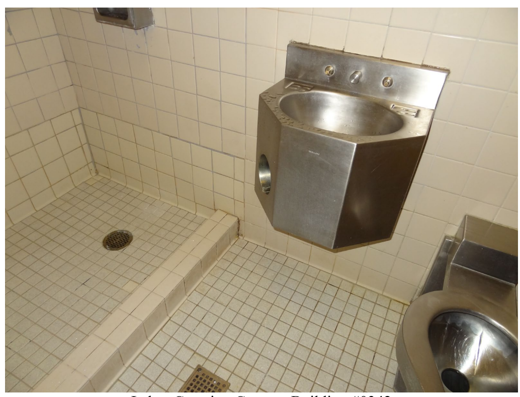
Lakes Crossing Center - Building #0342 Description: Shower Upgrades Needed.