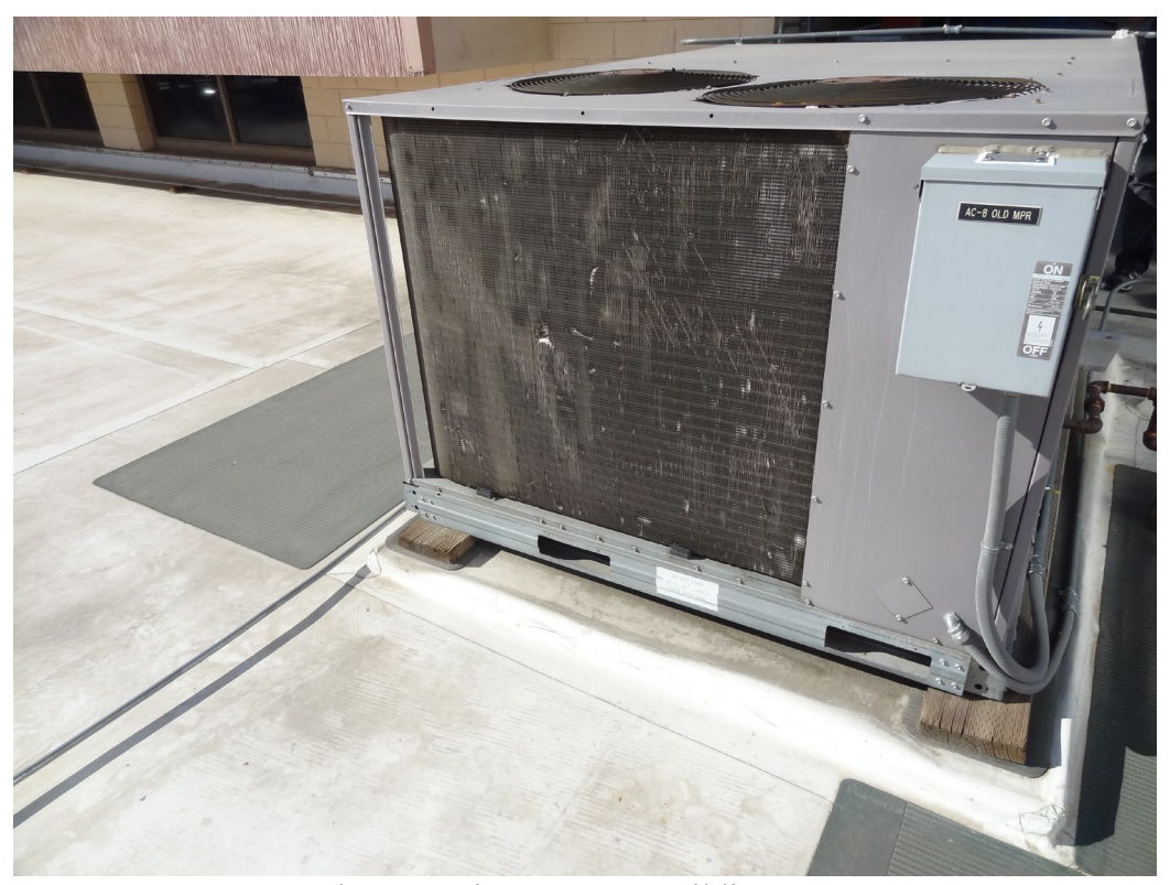
Lakes Crossing Center - Building #0342 Description: Rooftop Unit Replacement Needed.